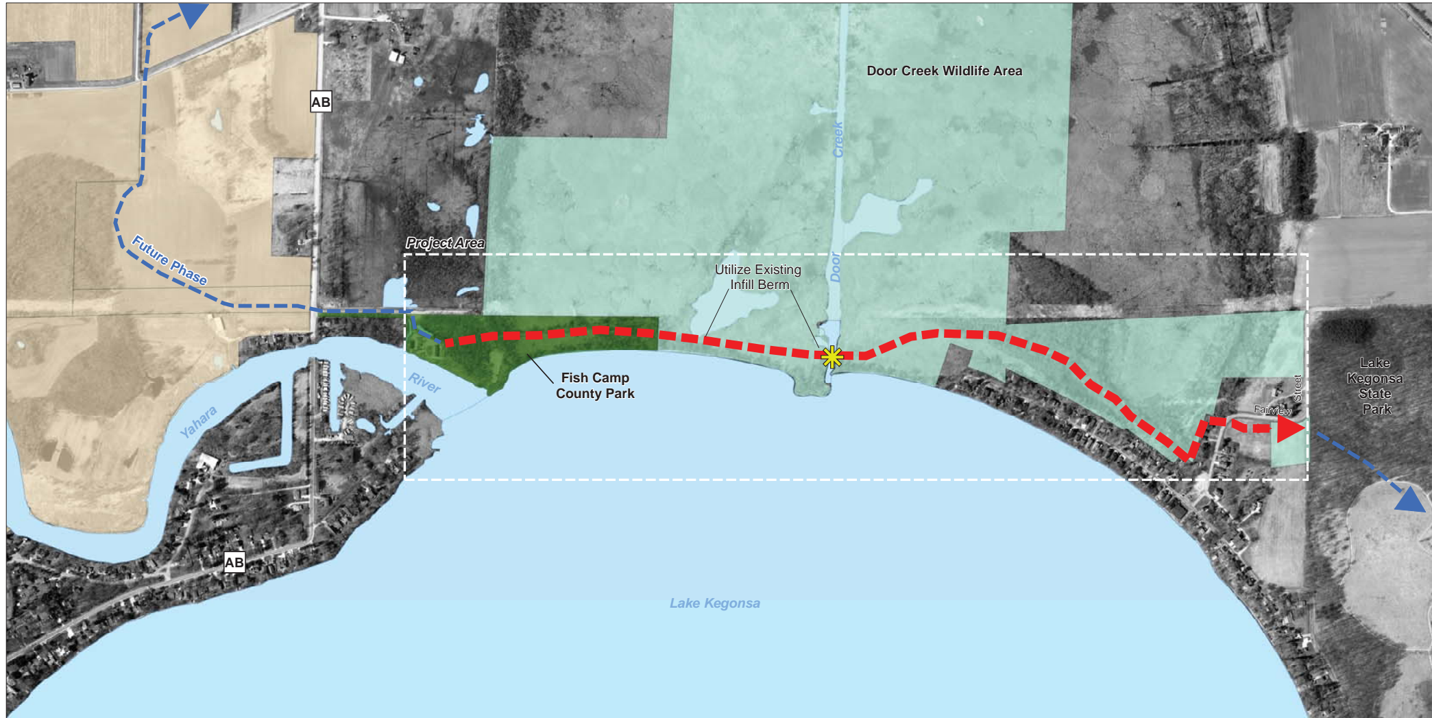
EXHIBIT B: PROJECT AREA