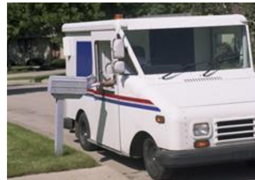
By mail – accommodation only