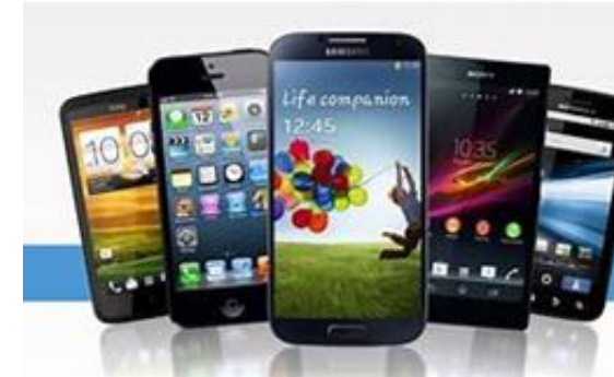
Use your Cell Phone or other Internet capable device