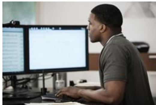
At your local library