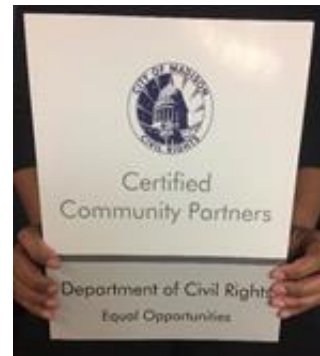
Your CCP Location