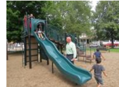
City Facilities and Services