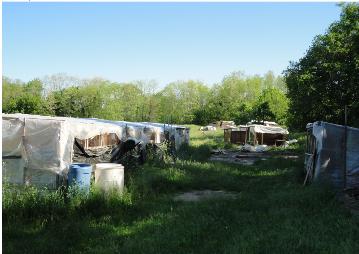
June 3, 2022