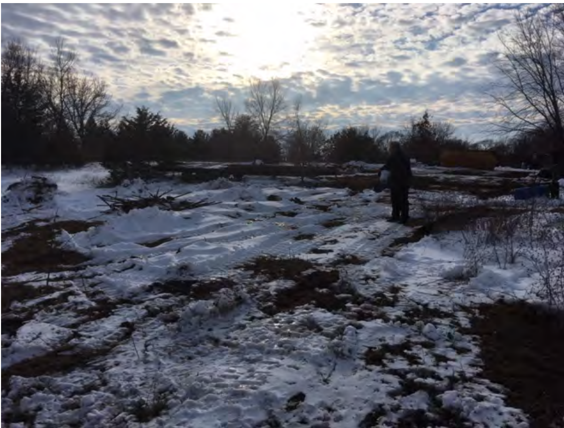
South side of property