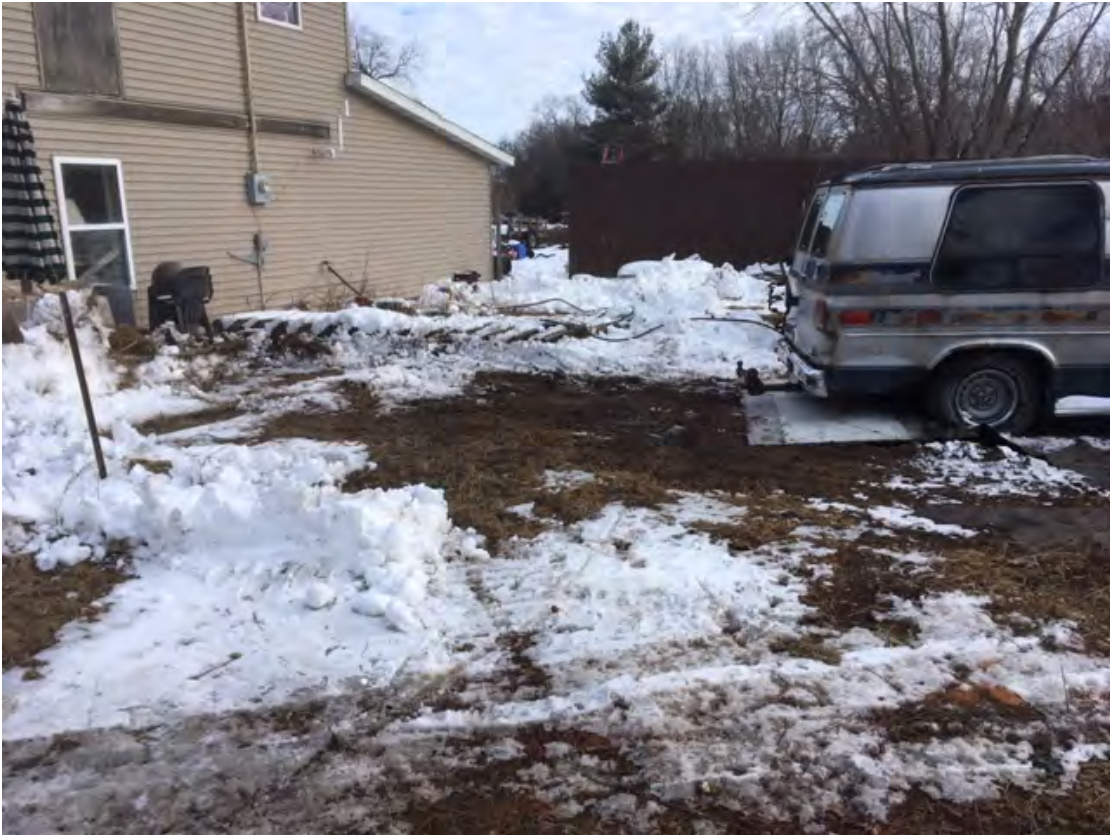
West side of property