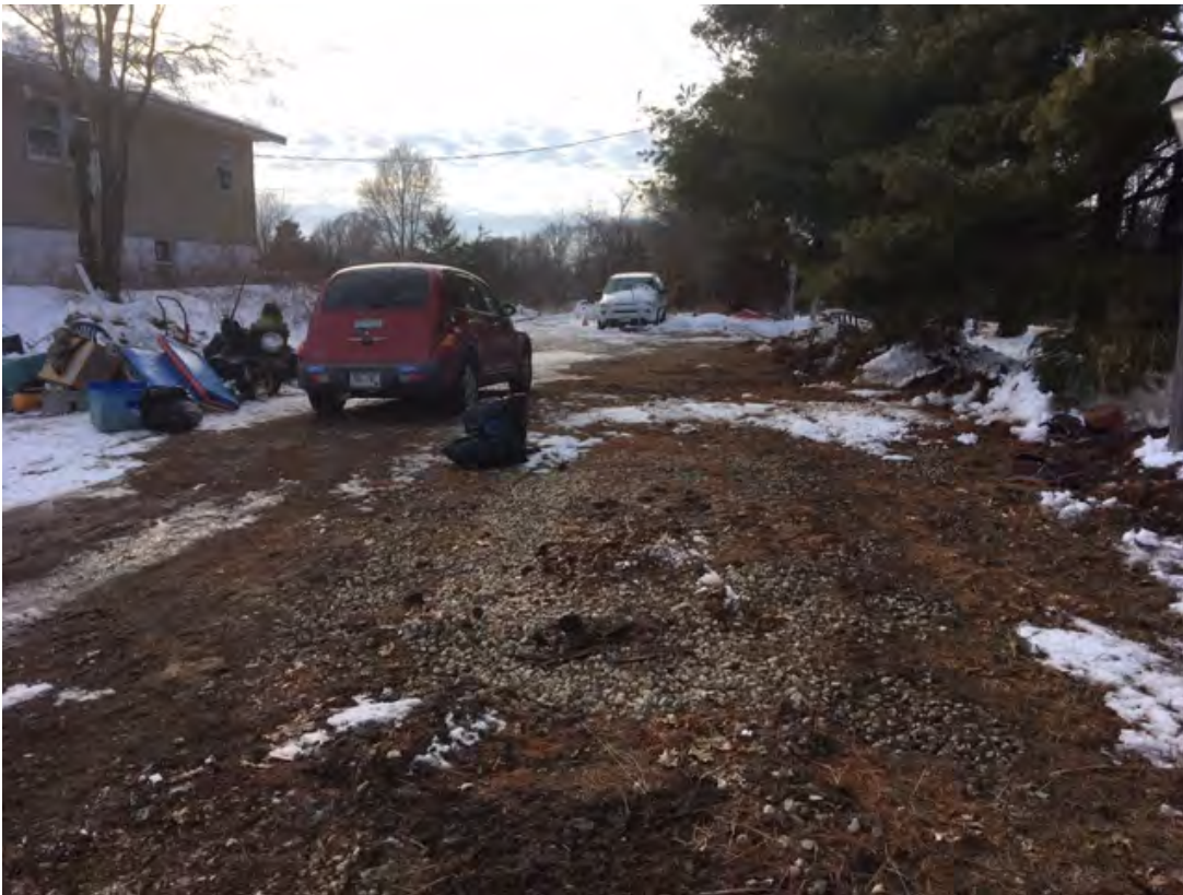
Front of property