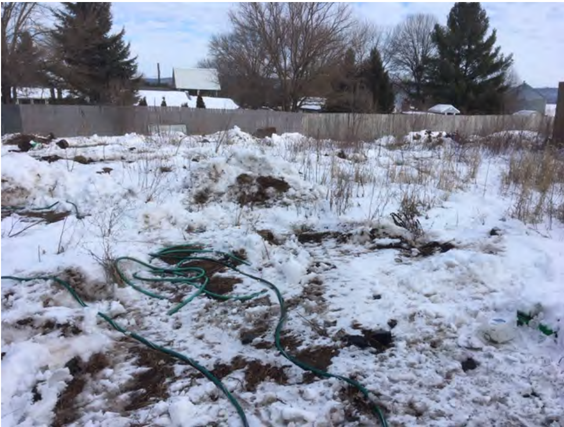
East side of property