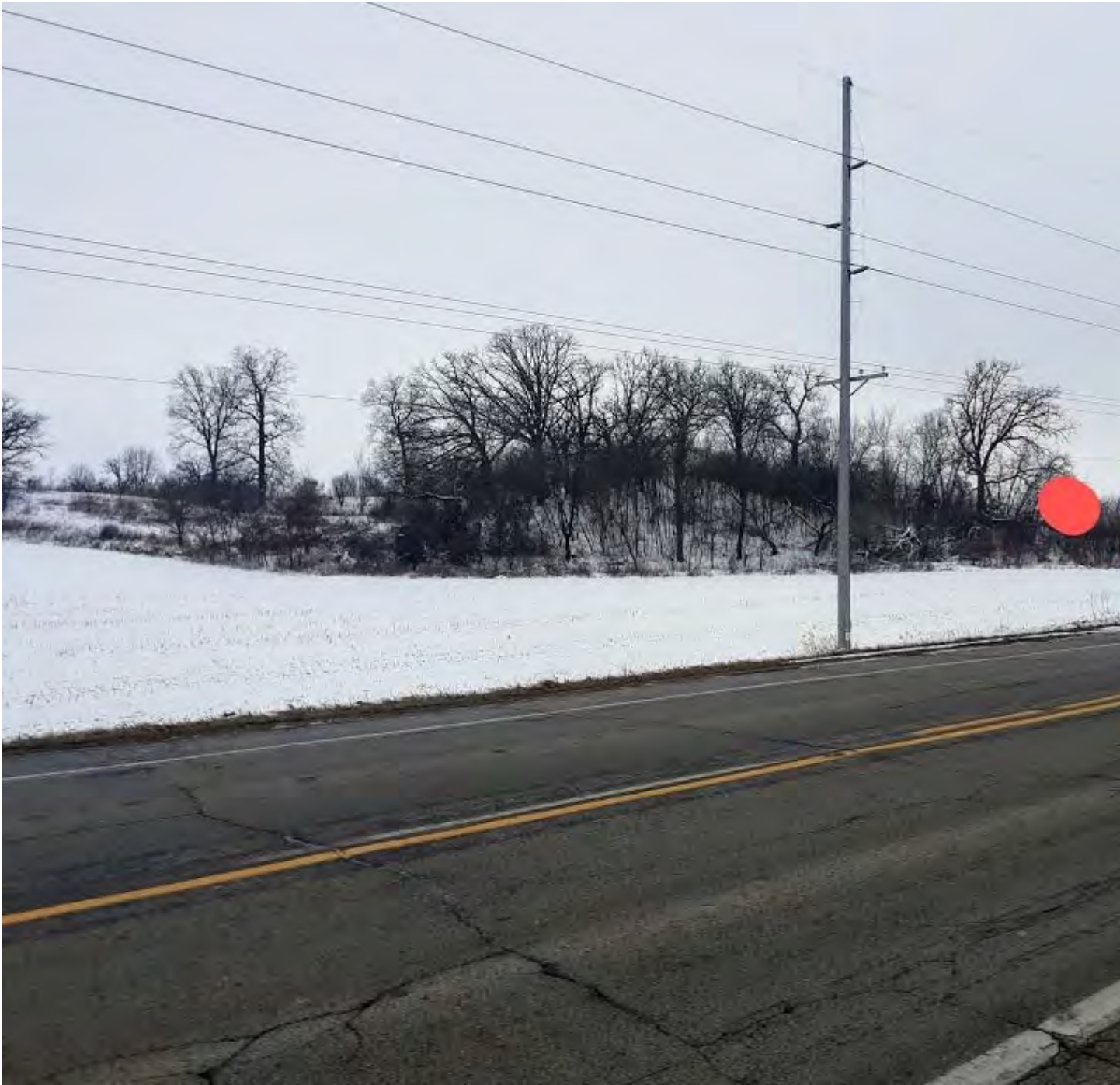
the destruction they leave behind