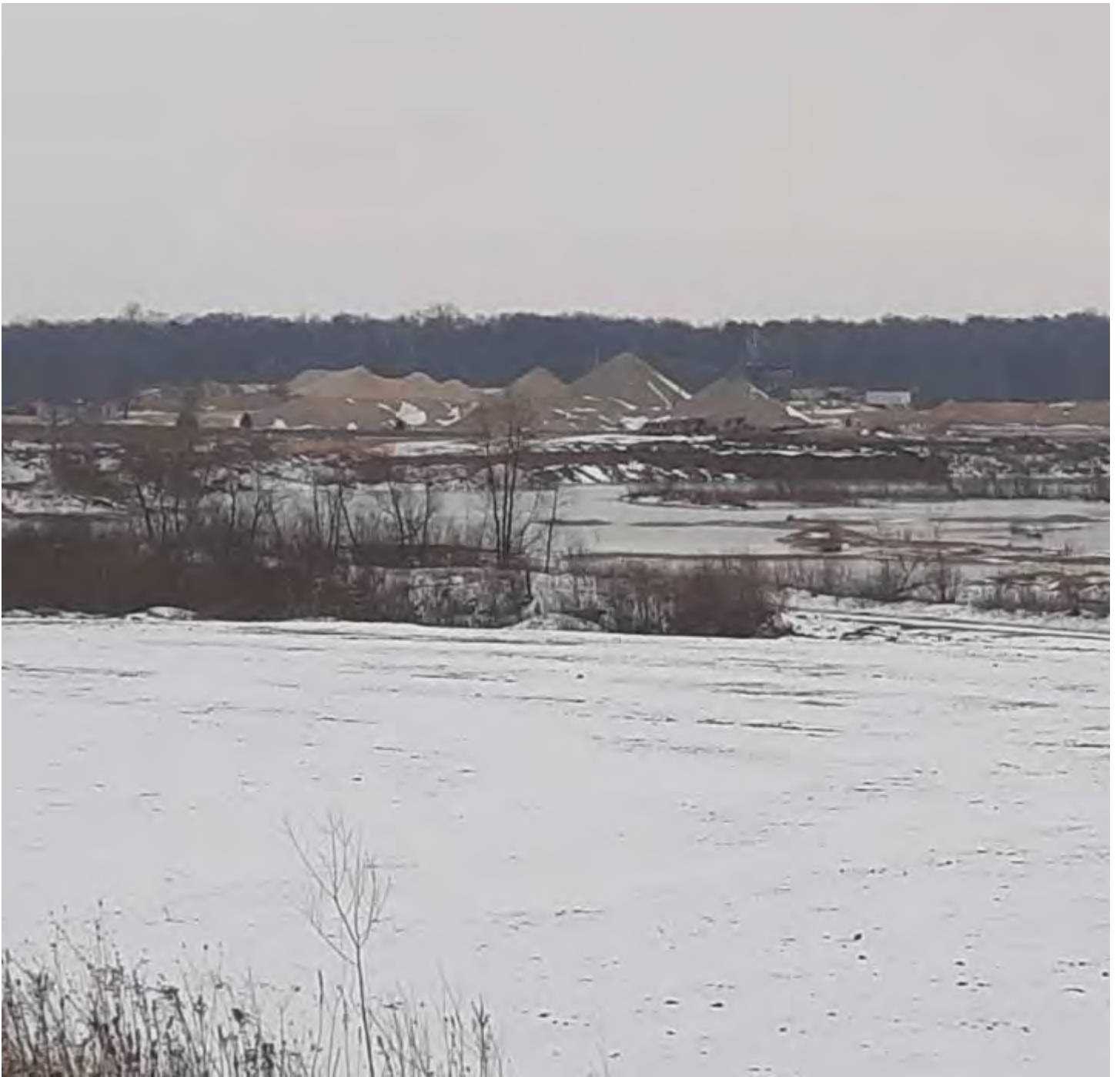
Conversation between farmer and town of Vienna... Wibu road this fall I took picture bellow