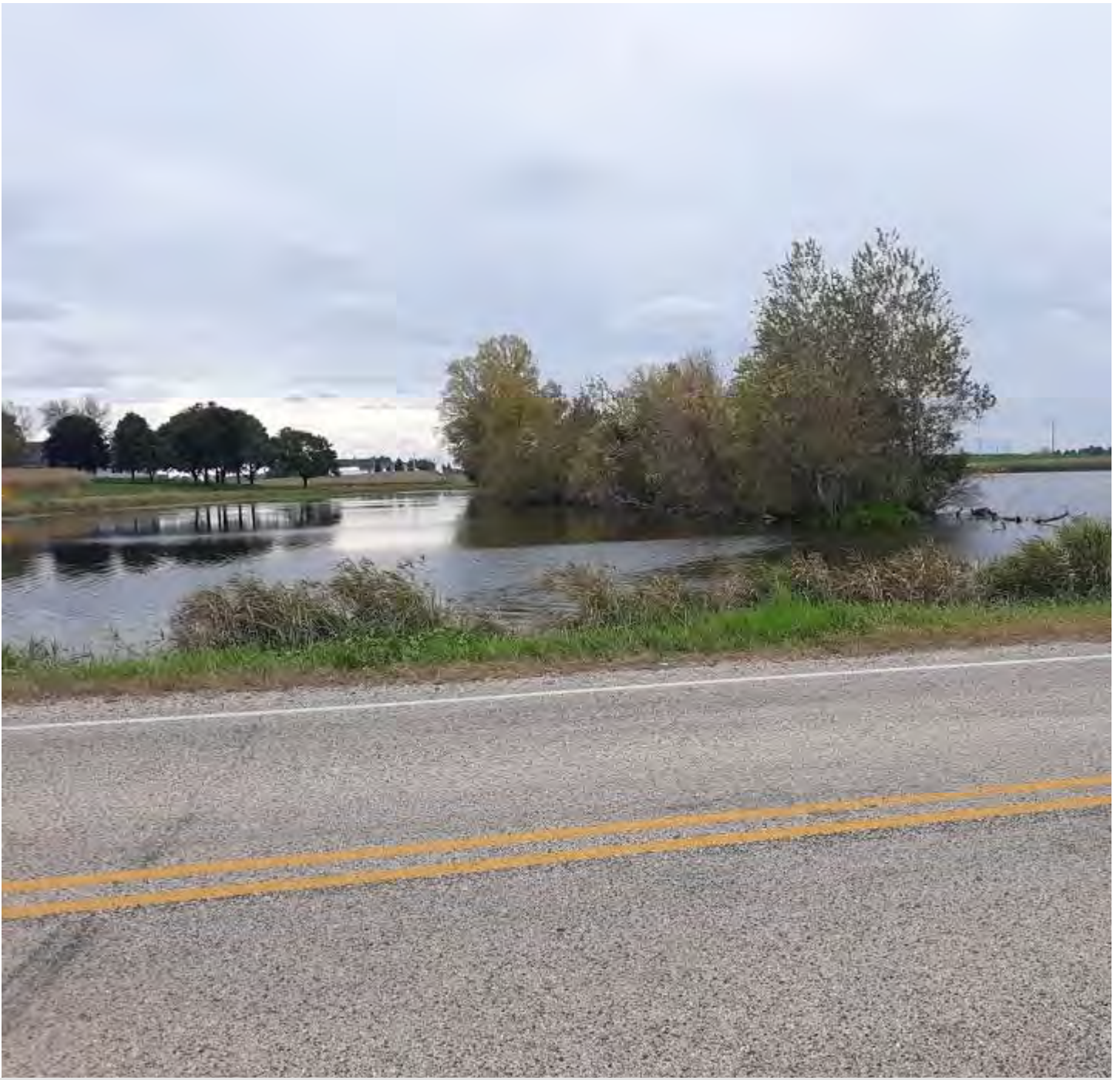
Bellow: Is my back yard when heavy rains and spring flooding. farm fields water runoff (filled with Manure and pesticides) you can see how dark it is.