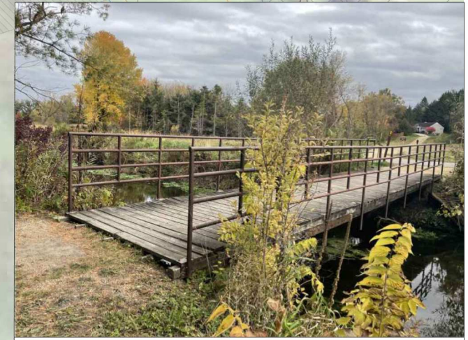
SITE PHOTO A - EXISTING BRIDGE TO BE REMOVED