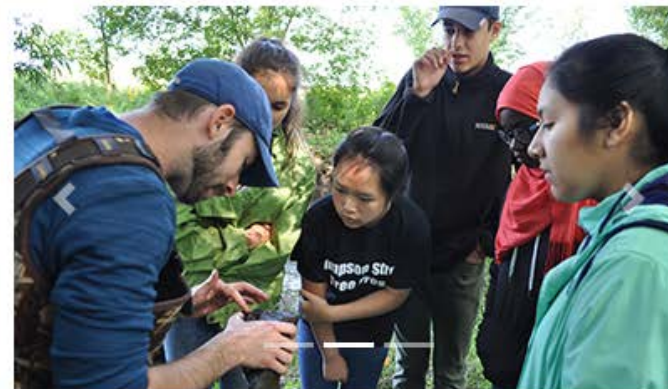
Simpson Street Free Press Internships

The department has a representative serving on the county's Racial Equity and Social Justice team and also has an internal team that works to implement the Equity and Inclusion plan and share learning resources with staff.