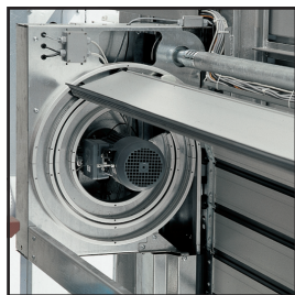
Compact AC Drive Motor