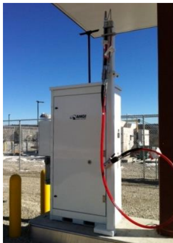
Note: Photos are for reference only and may not reflect exactly actual equipment offered.

NOTE: ANGI recommends the existing three (3) ½" dispenser feed lines per dispenser be replaced with two (2) ¾" feed lines to reduce pressure drop, plus one (1) vent line per dispenser. The existing dispenser inlet tubing and storage tubing must be replaced/modified by the contractor to accommodate this matrix design