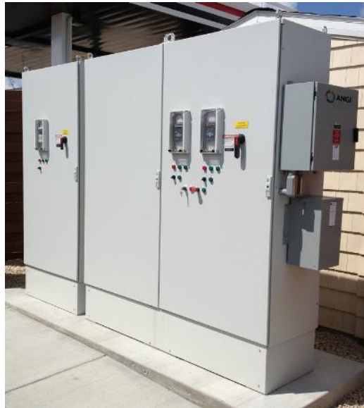
Note: Photos are for reference only and may not reflect exactly actual equipment offered.