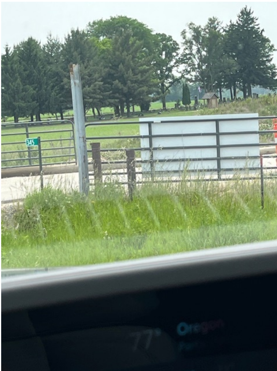
Open gate after hours 6/7/25