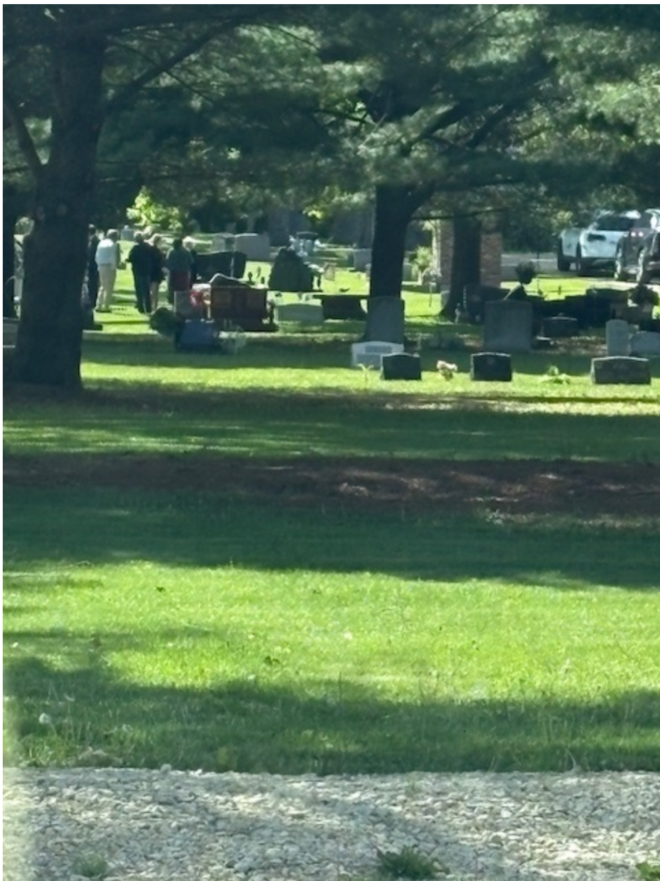
Quarry operations during funeral 5/23/25.