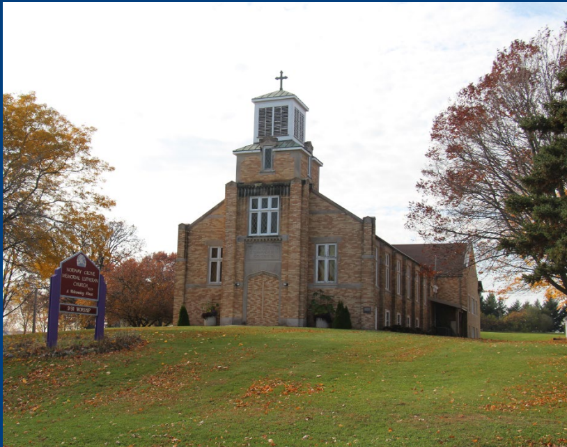
Norway Grove Lutheran Church, 1931 Vienna township Surveyed in 1979, 2014, 2022