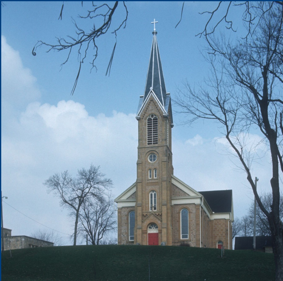
St. Norbert's Catholic Church, 1866 Roxbury township Surveyed in 1979