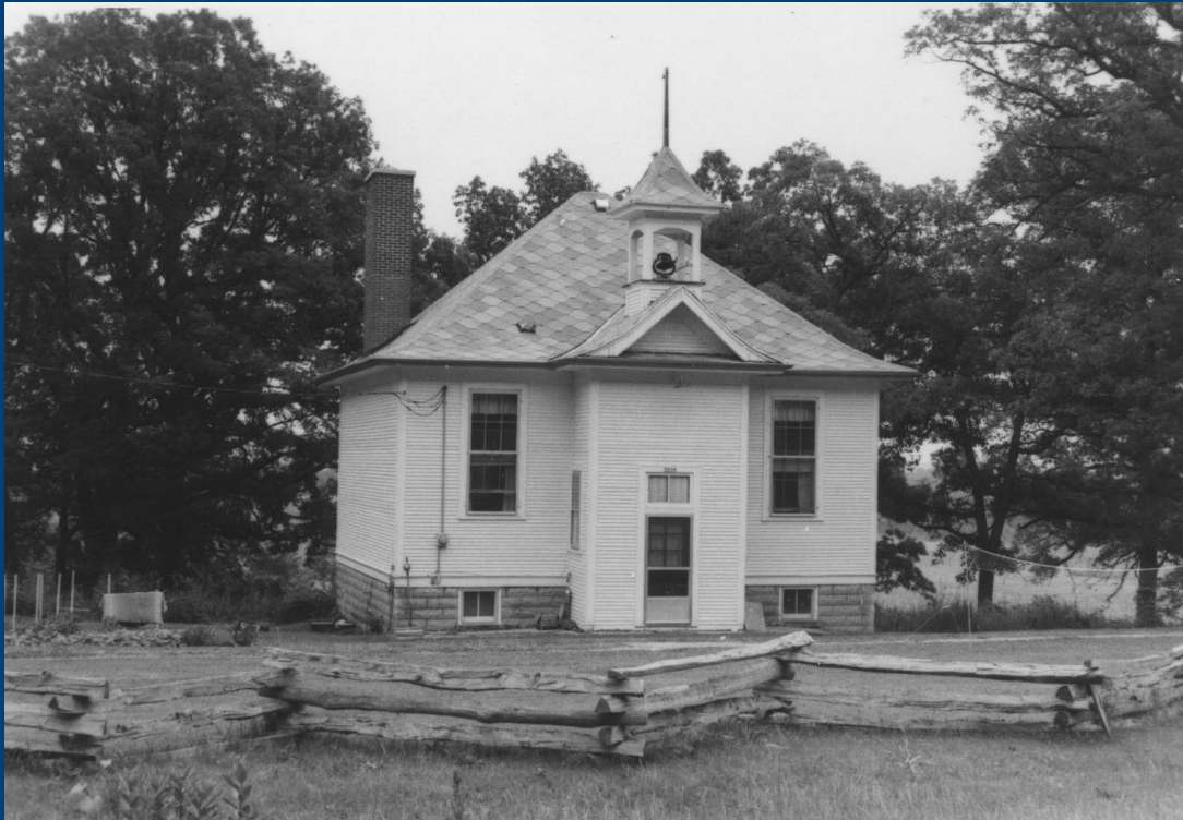
Deneen School, ca. 1925 Vermont township Surveyed in 1979