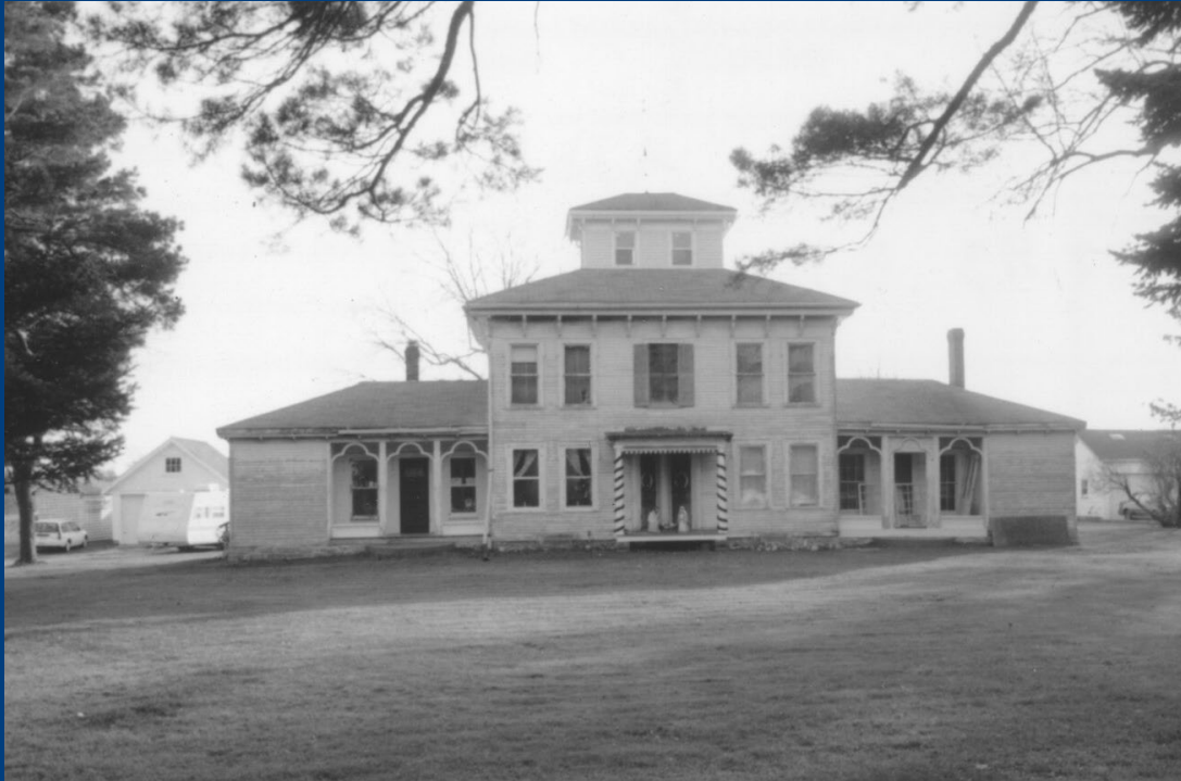
Italianate farmhouse, ca.1870 Albion township Surveyed in 2002