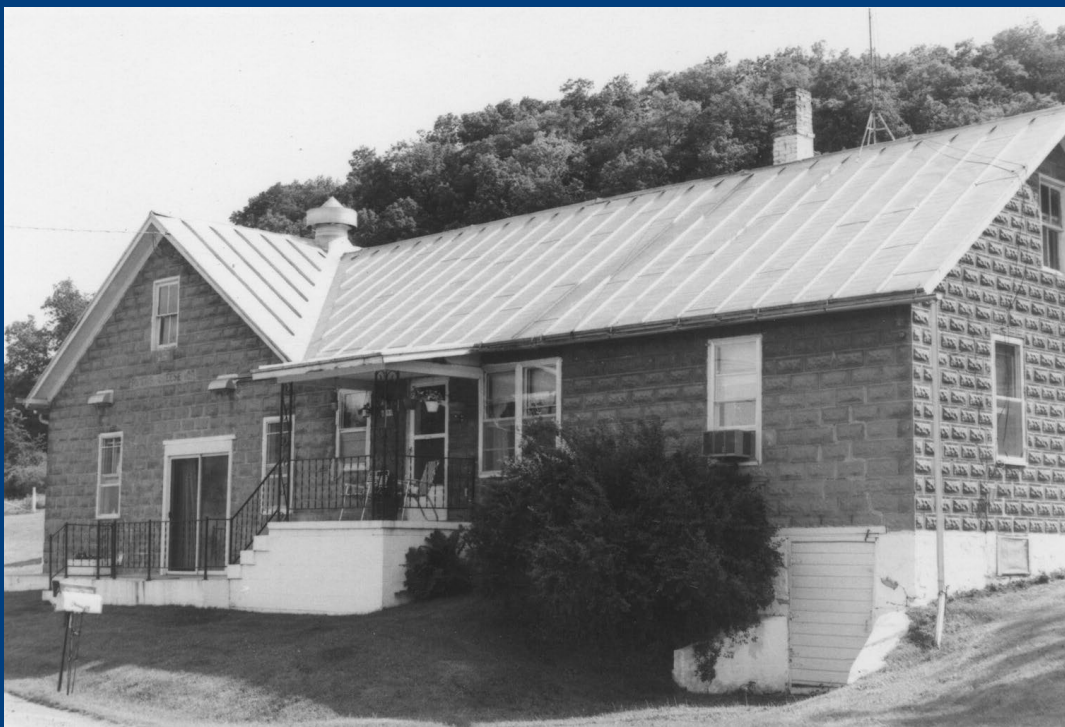
Cheese factory, ca. 1925 Vermont township Surveyed in 1979