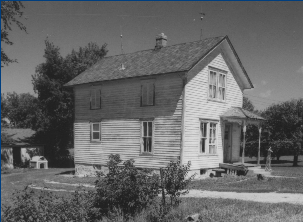
Vernacular farmhouse, ca.1890 Bristol township Surveyed in 1980