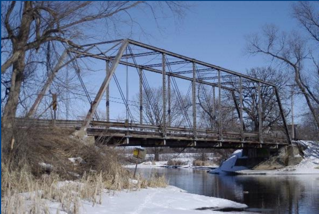
Dyreson Road bridge, 1897 Dunn township Surveyed in 1977, 2010