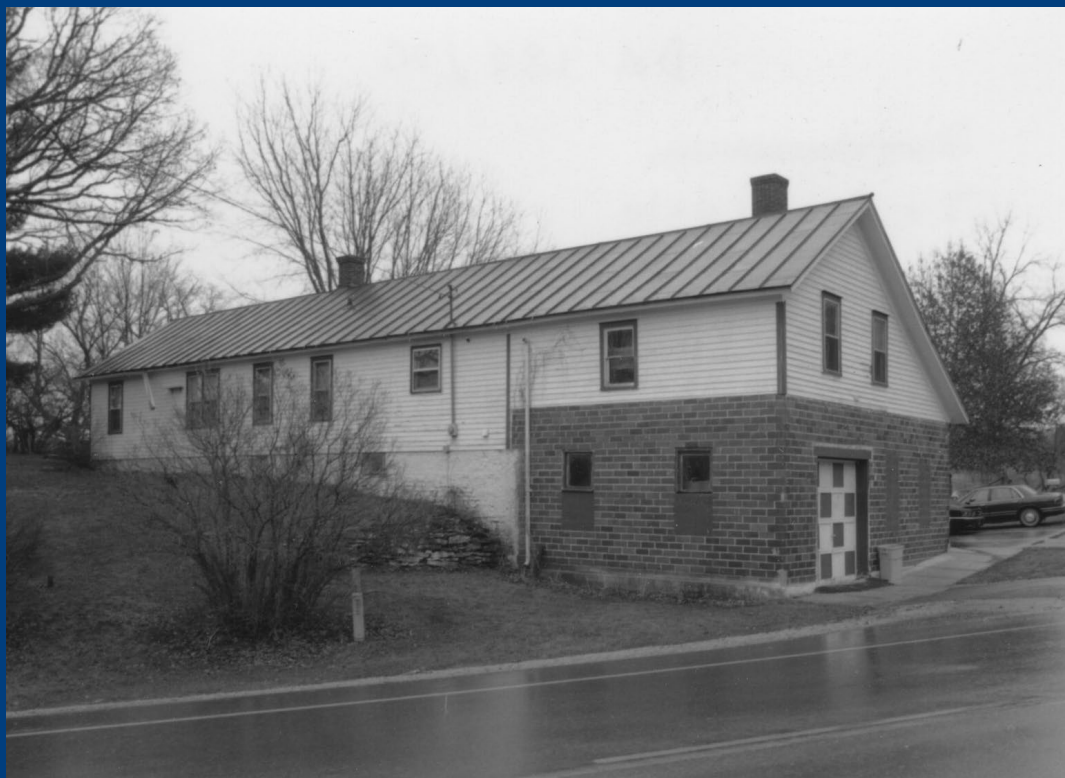
Cheese factory, ca. 1920 Springdale township Surveyed in 1980