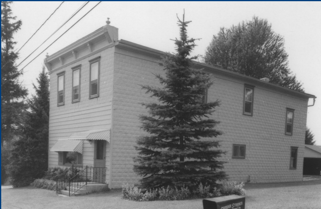
Commercial building, ca. 1890 Springdale township Surveyed in 1981