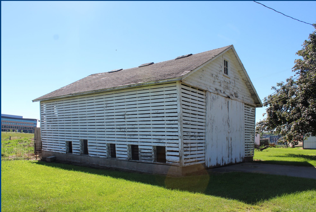
Corn crib, ca.1920 Burke township Surveyed in 2020, 2022