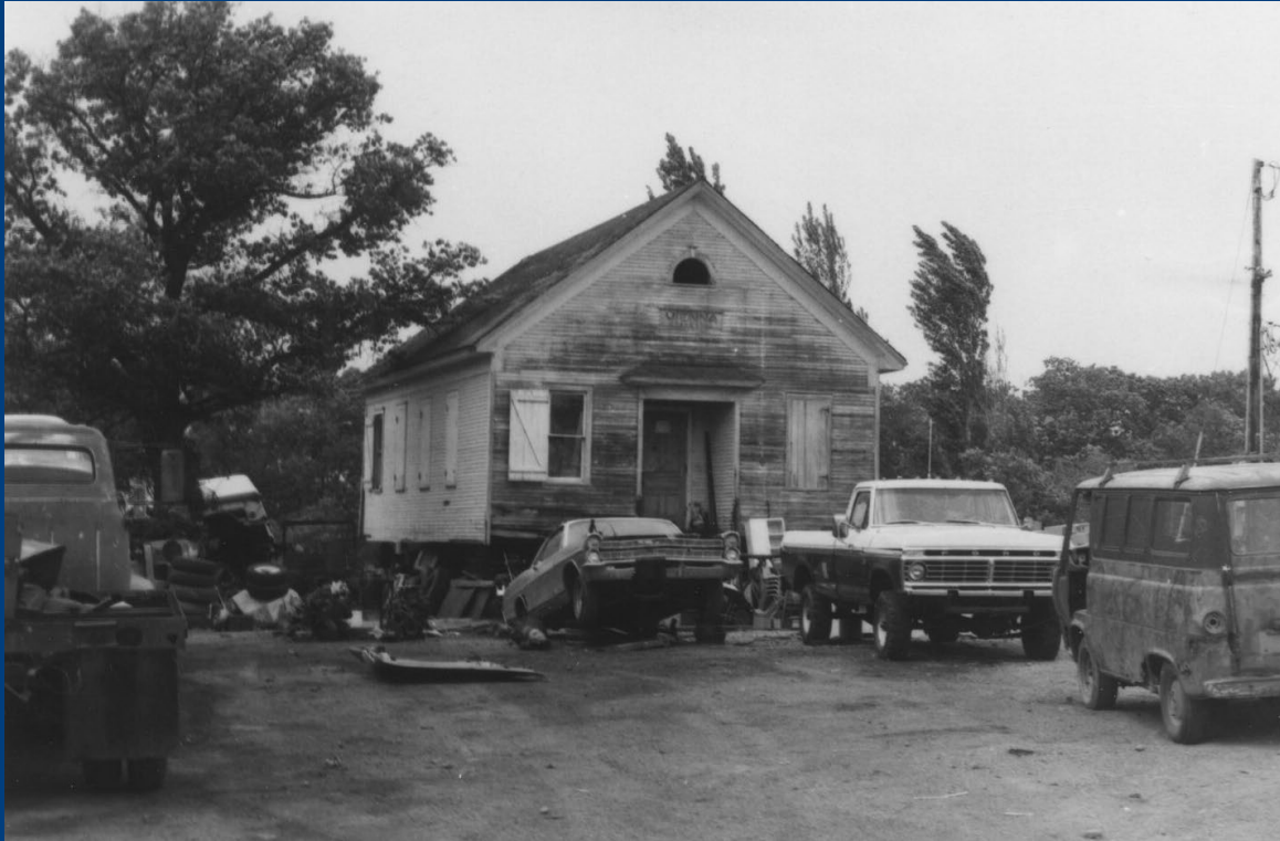
Vienna Town Hall, ca. 1900 Vienna township Surveyed in 1979