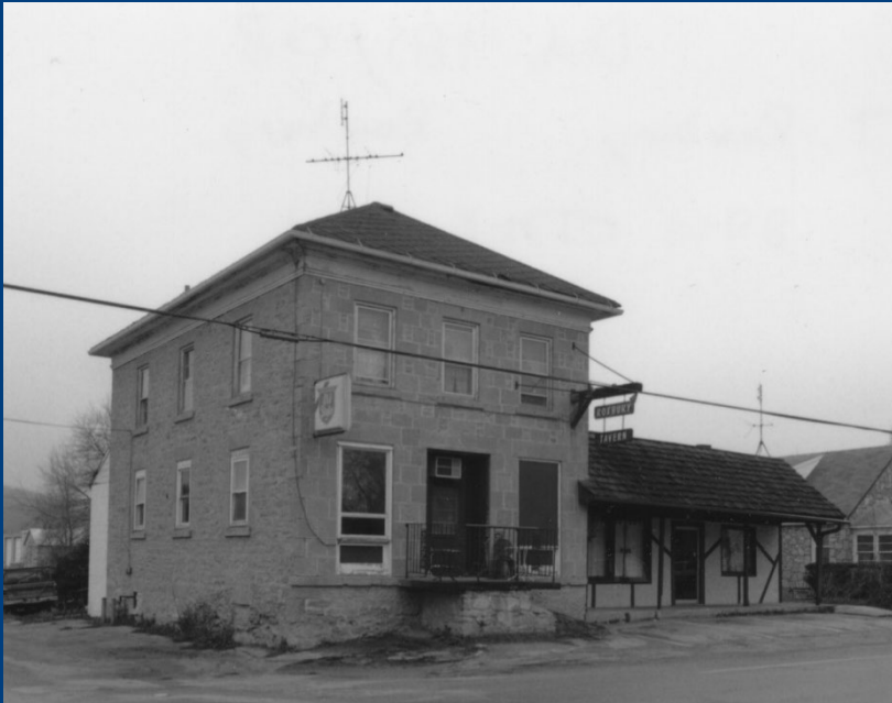
Reuter Store / Roxbury Tavern, 1969 Roxbury township Surveyed in 1979