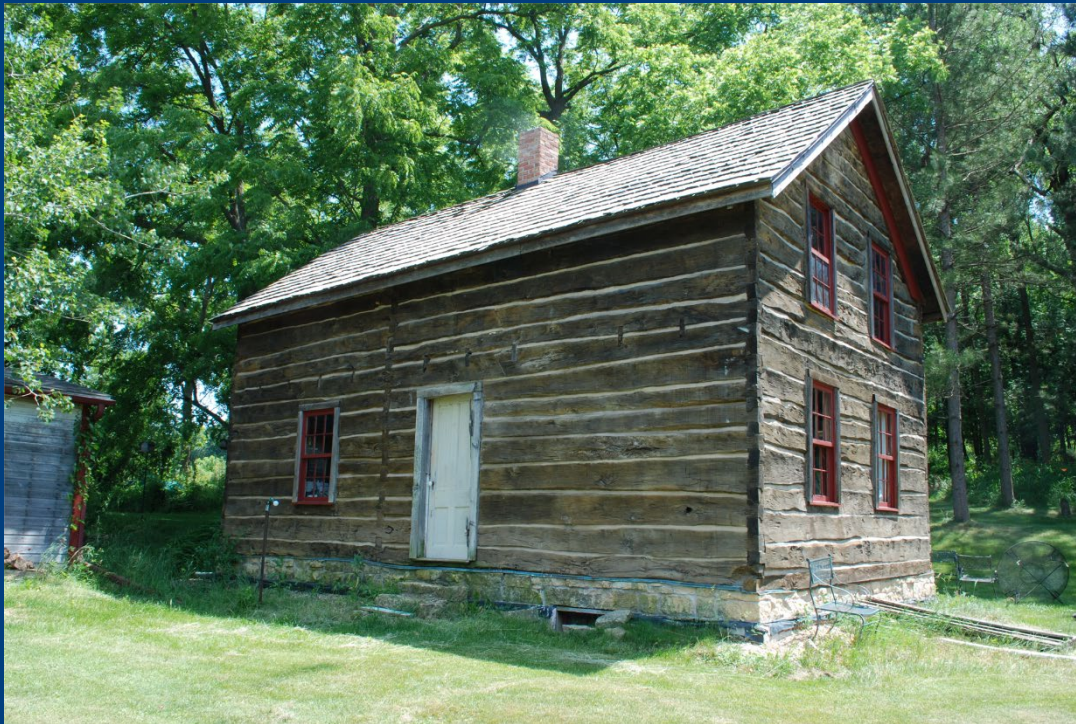
Ingebrit Peterson house, 1857 Primrose township Surveyed in 1997