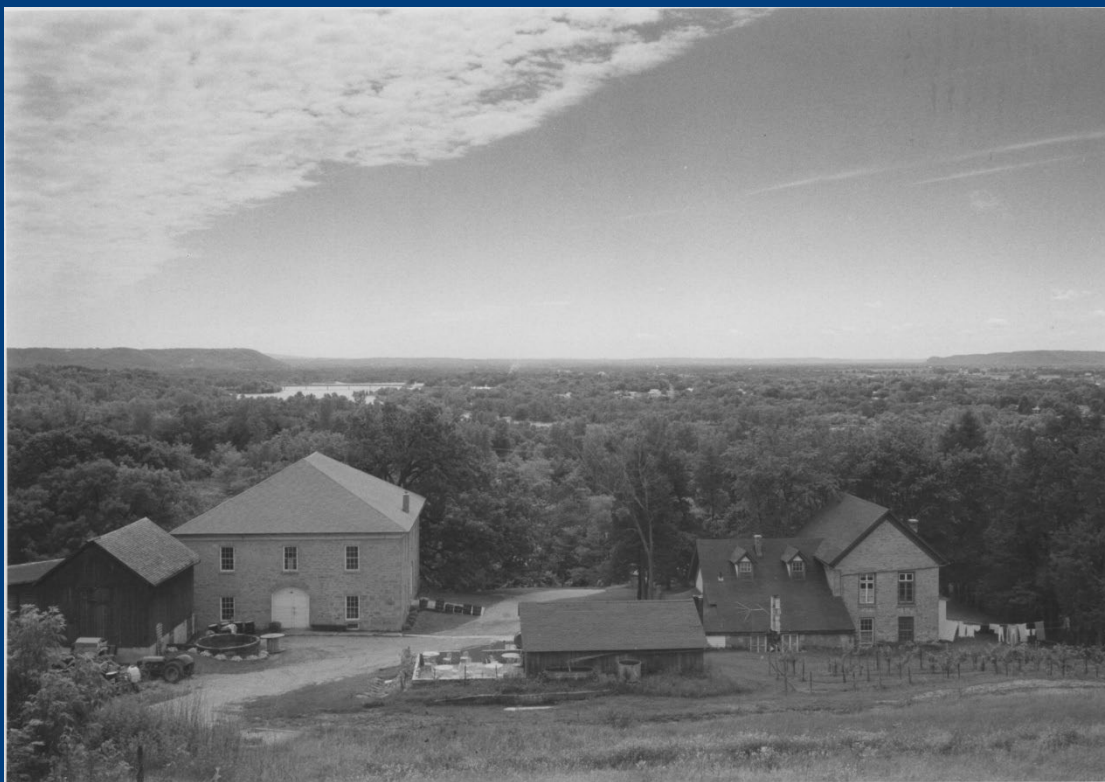
Kehl Winery, 1858 Roxbury township Surveyed in 1997