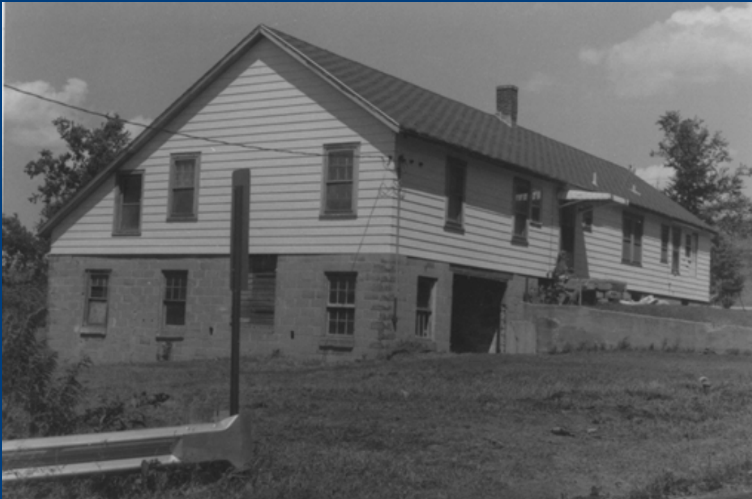
Cheese factory, ca.1920 Dunn township Surveyed in 1977