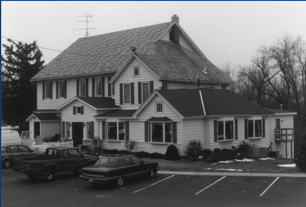
Young's Riverside motel/restaurant Roxbury township Surveyed in 1979,1993