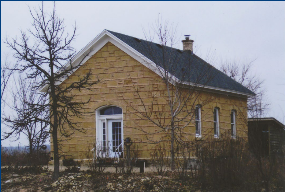
Joint School District #3, ca. 1874 Roxbury township Surveyed in 1979, 1993