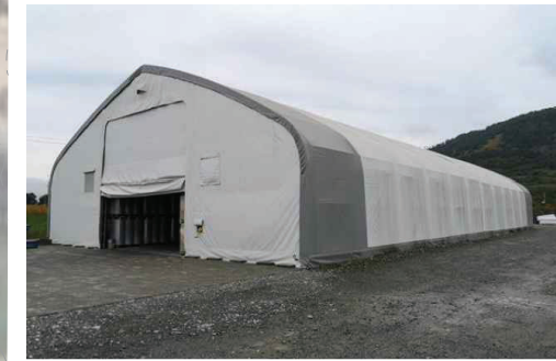
PROPOSED BUILDING IMAGE