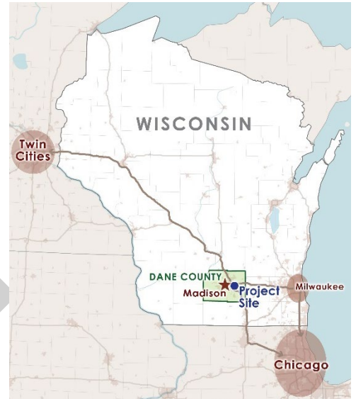
Sustainability Campus and Conceptual Locations of Facilities

The Dane County, Wisconsin, Department of Waste & Renewables is soliciting responses to this Request for Information (RFI) to gather information and qualifications from entities (Respondents) that are interested in establishing innovative waste diversion-related research, art, or educational partnerships within the Sustainable Business Park to be co-located with the future Dane County landfill in Madison, Wisconsin. This project is underway with the first phase of construction commencing in 2026 for a new landfill and a new administration and education building (conceptual administration and education building location below). The landfill and related support facilities will be operational in 2027/2028. Through this RFI, the County is seeking core tenants to form the foundation of the Sustainable Business Park and advance sustainable materials management, research, and education.