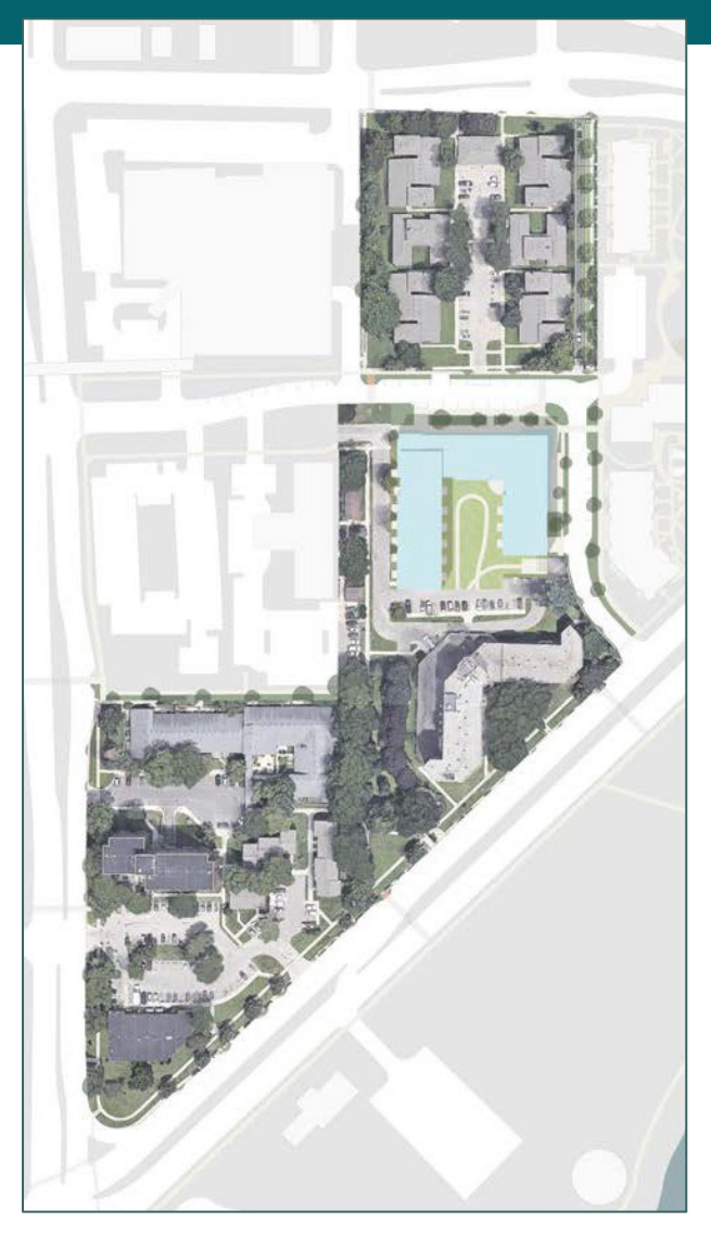
PHASE 1 | 164 Units - Taking Shape B1 Estimated Completion 2026