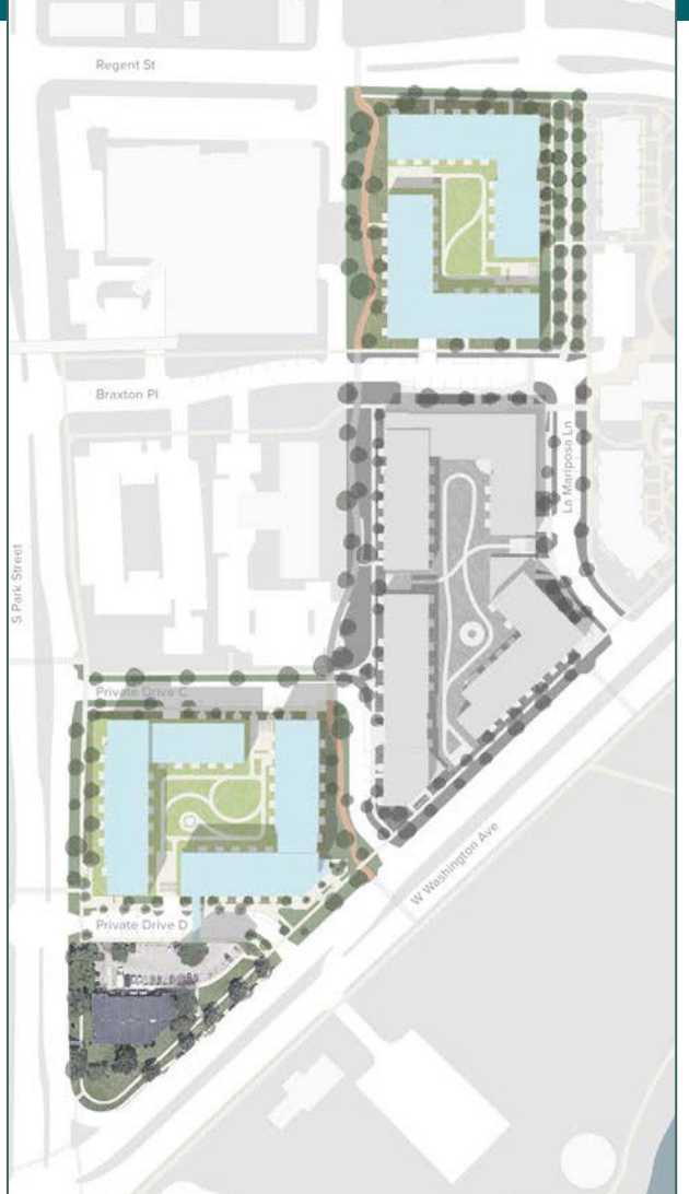
Estimated Completion 2032