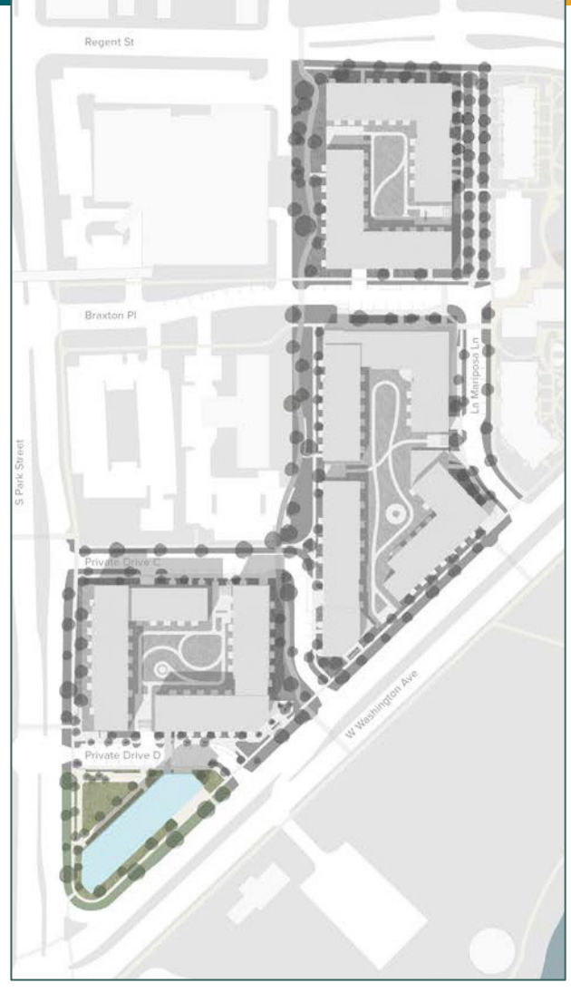
PHASE 5 | 166 Units Estimated Completion 2034