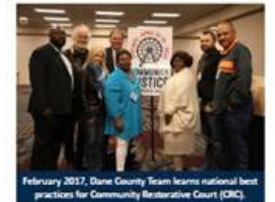
February 2017, Dane County Team learns national best practices for Community Restorative Court (CRC).

Dane County Criminal Justice Council (CJC) engages multiple strategies to change criminal justice