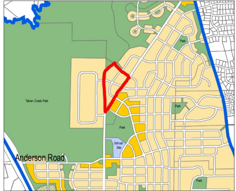
City of Madison Pumpkin Hollow future land use map excerpt

The property is covered by the city of Madison’s Pumpkin Hollow Neighborhood Development plan , within the broader Far Northeast planning area. The city’s plan designates the property as low density residential, though the city’s definition of that designation differs significantly from the town’s (up to 16 dwelling units/acre vs. up to 4 dwelling units/acre). The city’s future land use map depicts two possible roadways to both facilitate new, and access existing, development (see map at right).