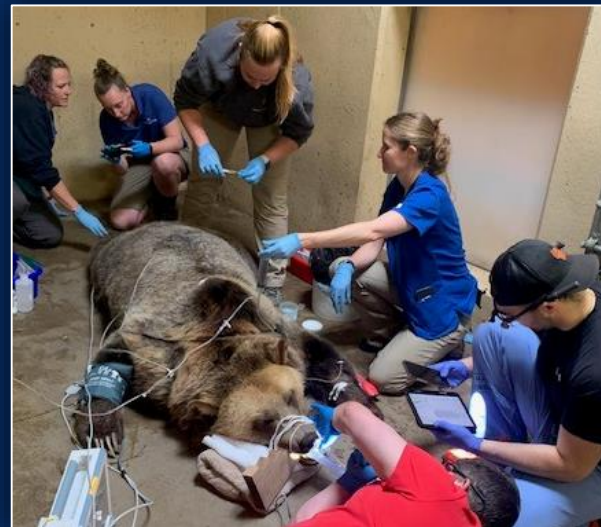
Grizzly Bear Procedure with UW Vet School