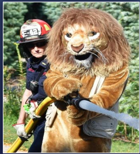
Zoo mascot helping promote MFD Zoo Takeover Event