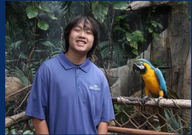
Boys and Girls Club Intern