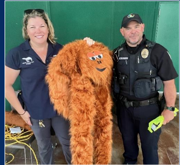
Escaped Animal Drill Coordinated with MPD 8/28/24