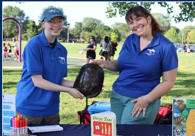
Henry Vilas Zoo Outreach Table