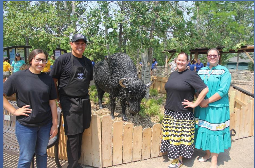
Collaborative Exhibit with Ho-Chunk