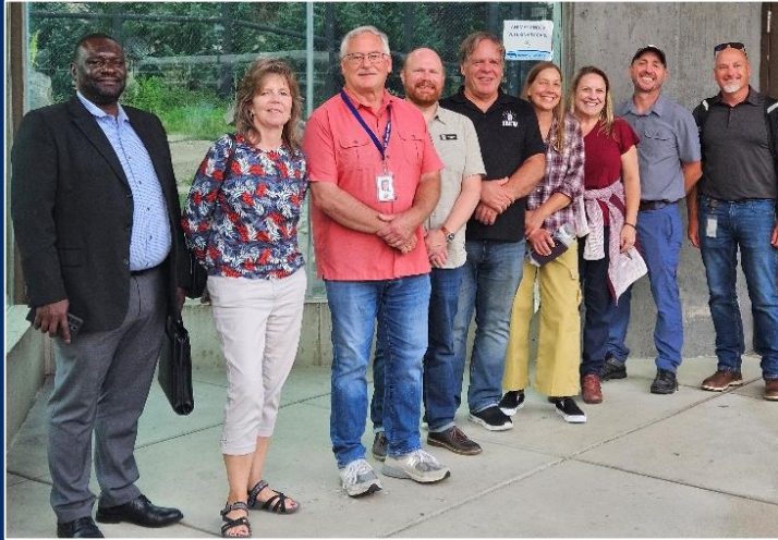
Public Works & Transportation Committee Meeting 8/20/24