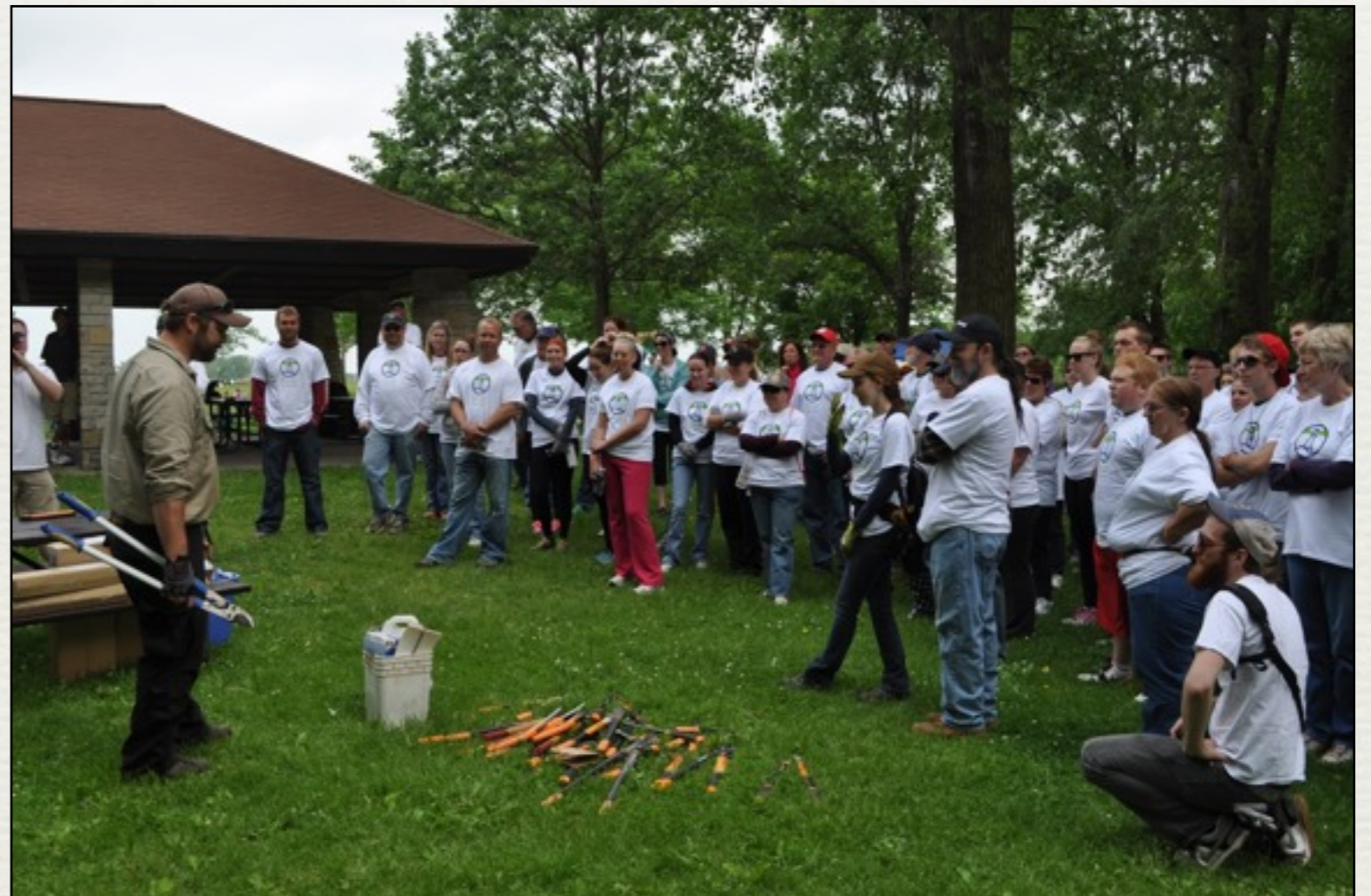
June 12, 2014 Lands' End at Lake Farm County Park