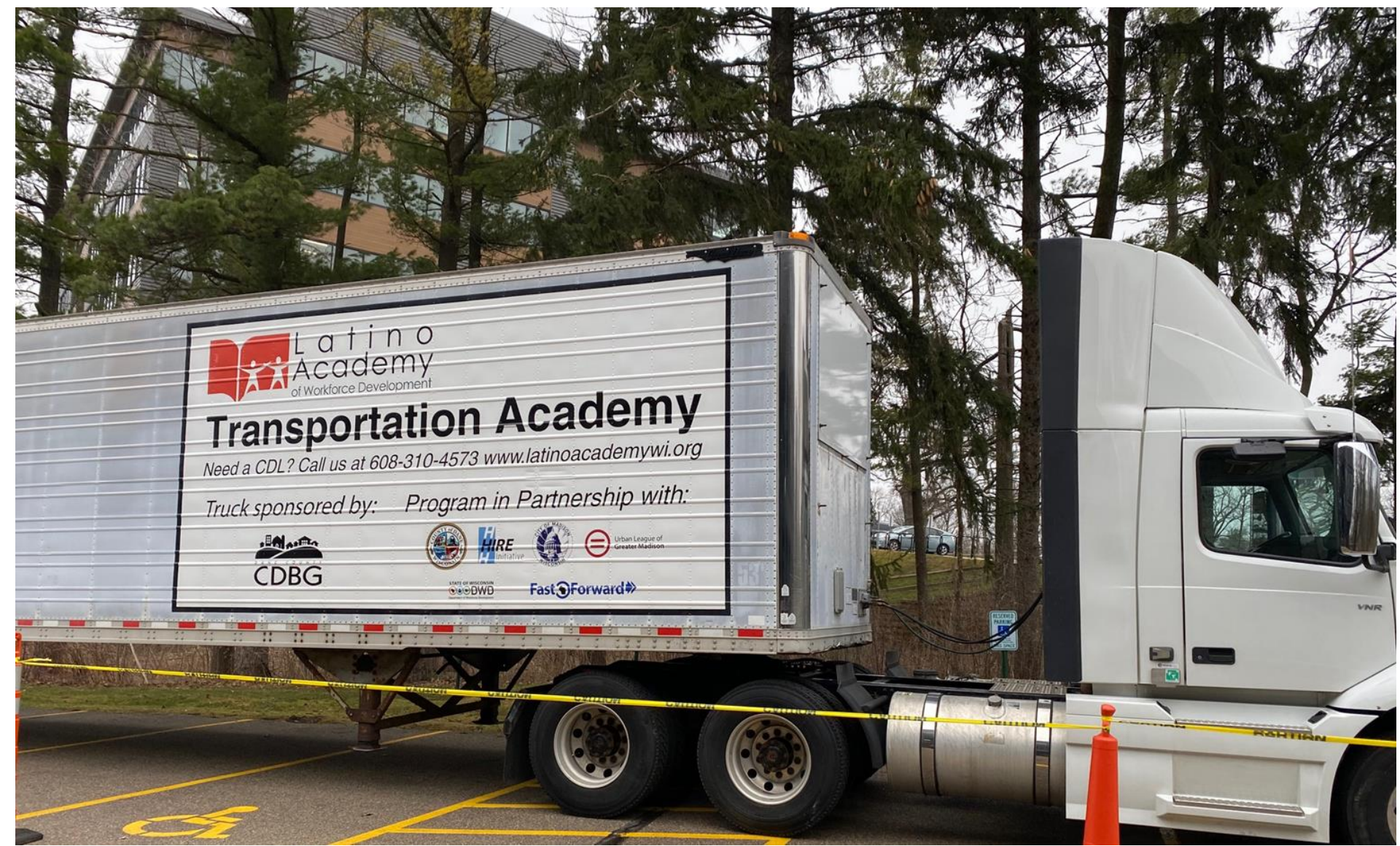
Truck purchased with CDBG Funds, 2018