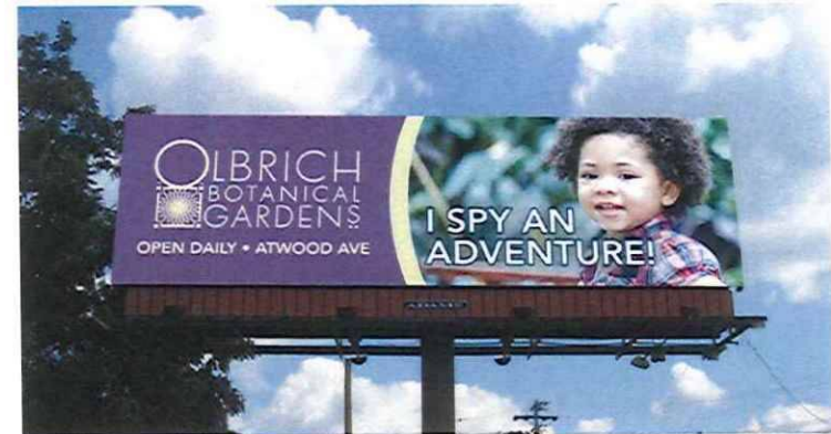
Olbrich Botanical Gardens