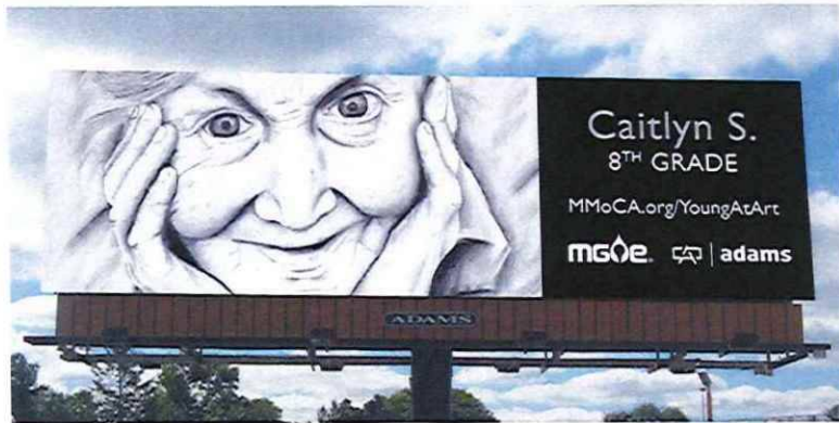
Madison Museum of Contemporary Art