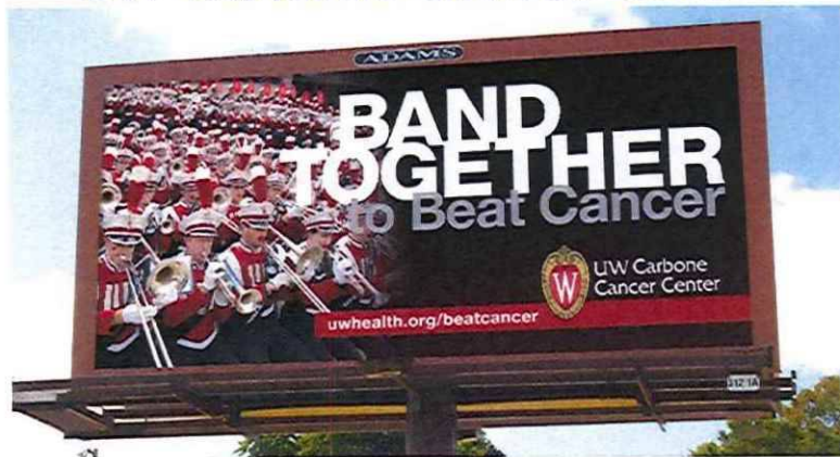
UW Carbone Cancer Center