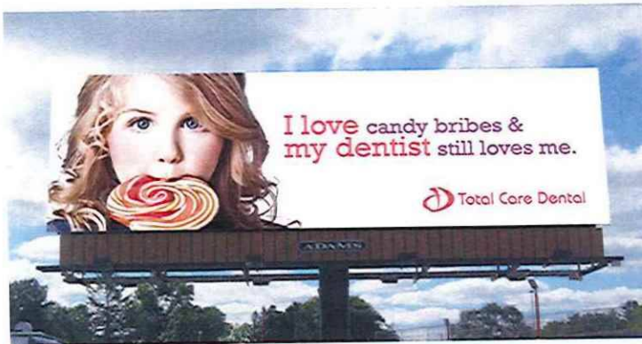
Total Care Dental