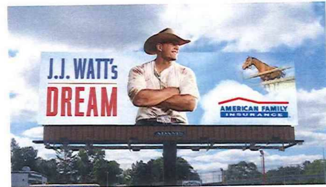
American Family Insurance