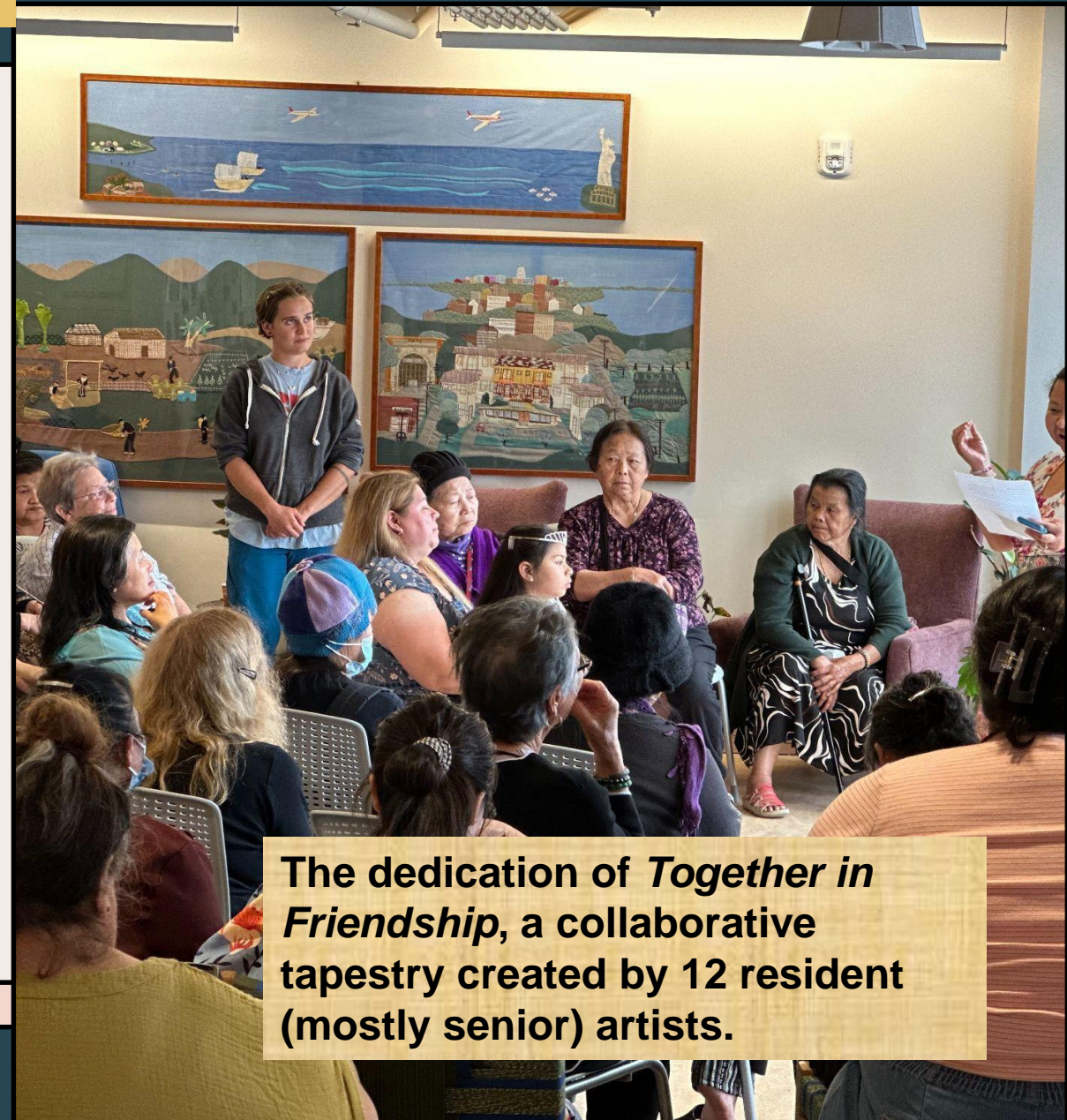
The dedication of Together in Friendship , a collaborative tapestry created by 12 resident (mostly senior) artists.

The Leck funding was perfectly timed to support expanded programming that keeps people connected socially, and fosters positive health outcomes.