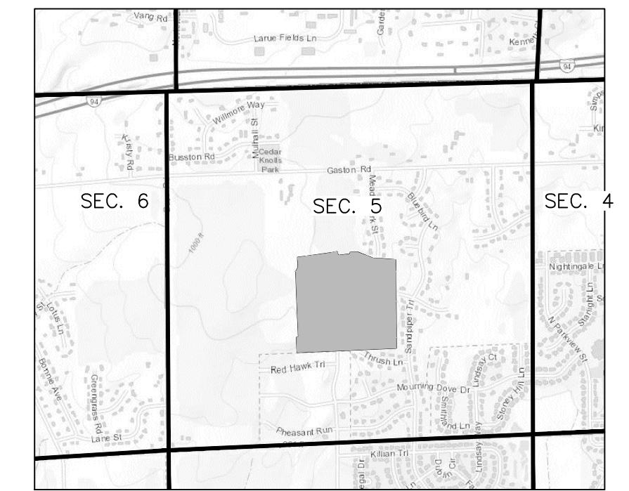
Vicinity Map Not to Scale

North is referenced to the South line of the SW 1/4 Section 5, T.7N., R.11E., Dane County Coordinate System, grid bearing S87°38'07\"