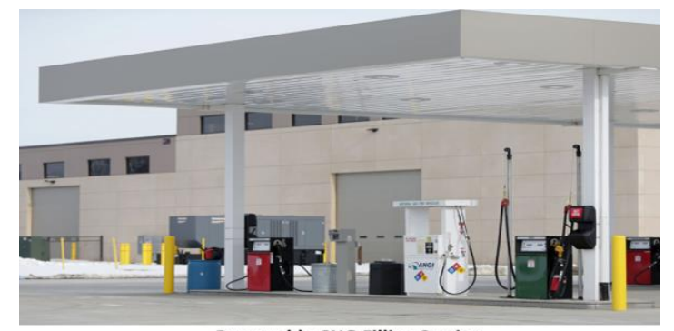
Renewable CNG Filling Station