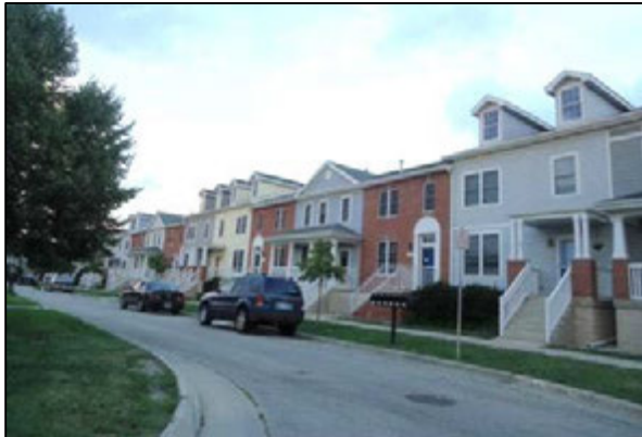
The City of Sun Prairie "Providence" planned neighborhood provides a mix of single family attached and detached homes, two family side by sides, apartments and condos. This development also incorporates design standards for setbacks, roadway width and building facades.

Description: This land use category will include a carefully planned mix of single-family residential development including some single-family, two-family, and multi-family residential and a mix of non-residential uses such as neighborhood scale commercial, office, parks, and institutional uses. This district is to function primarily as a residential district but provide access to neighborhood commercial within a half mile of the majority of residents within the district.