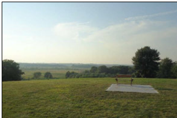
A scenic outlook within the Town.

Description: Natural areas consist of undeveloped areas including non-productive farms, areas with unique natural features, steep slopes, and environmental corridors. These continuous systems require protection from disturbance and development and consist of wetlands, stream channels, floodplains,