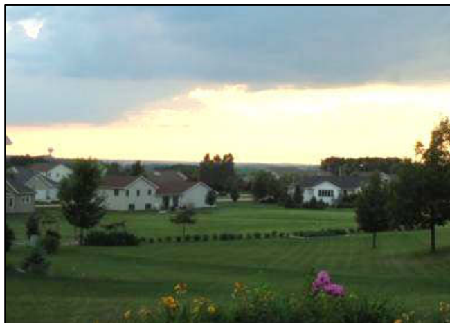
Burke Conservancy Estates provides low-density residential on half-acre lots.

Description: The low-density residential land use district includes areas for planned residential development in and around areas of existing single-family development. Recommended residential net densities in this land use district should range from approximately two to four dwelling units per acre. The land use district is intended to include single family detached and attached dwellings.