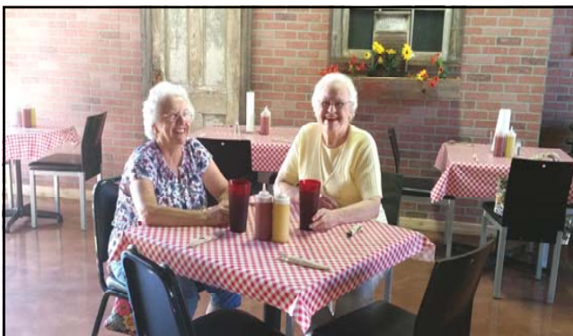
The My Meal-My Way senior dining site at Ziggy's BBQ & Ice Cream Parlor in Oregon offers a new approach to affordable, nutritious, and unique senior dining.

***Elder Benefit Specialist (EBS) Program