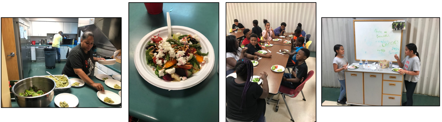
Summer program meal prep; example veggie mini-meal; lunch-time enjoyment of the CSA share vegetables.

The second organization served by the Partner Shares Plus program was the Packer Community Learning Center , which is located in the Packer Townhouses on Northport Drive on the northside of Madison. The center received one regular size CSA share, which they utilized in a multitude of ways. An a semi-retired neighborhood resident chef, made weekly mini-meals from the share for the children’s summer program held at the center. The program coordinator at Packer would quiz kids in the program about their knowledge of the vegetables in the share and would initiative basic conversations about local and organic farming. Any unused vegetables were distributed to households within the townhouses, and the response from families was extremely positive.