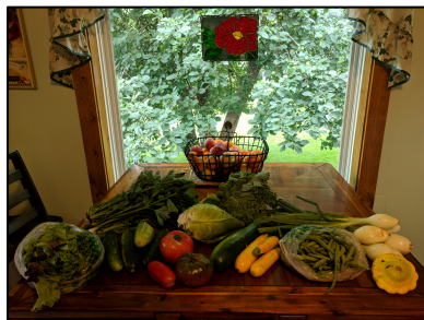
CSA share photos sent by Partner Shares members to FairShare staff.