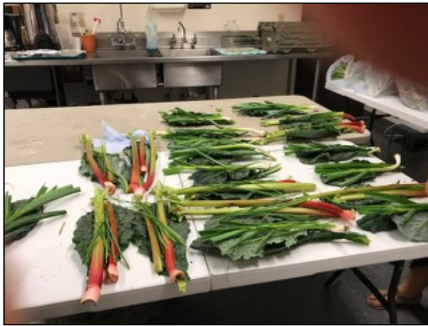
Veggie packs ready for distribution at Segoe Terrace.

The evaluations will be aggregated and analyzed in mid-November, now that the season has ended, and the staff champion at Segoe Terrace has had time to collect all of the final evaluations. Results will be shared at the November Food Council meeting. Initial anecdotal accounts from residents themselves, the on-site champions at Segoe Terrace, MOM volunteers, and the farmers indicate that the participants appreciated the shares, enjoyed the freshness of the vegetables and cooking with new varieties of produce, and relished the opportunity to get to know their farmers.