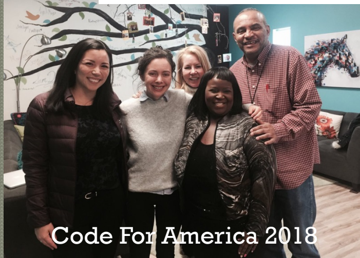
Code For America 2018