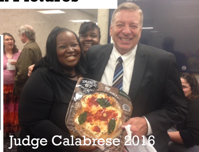
Judge Calabrese 2016