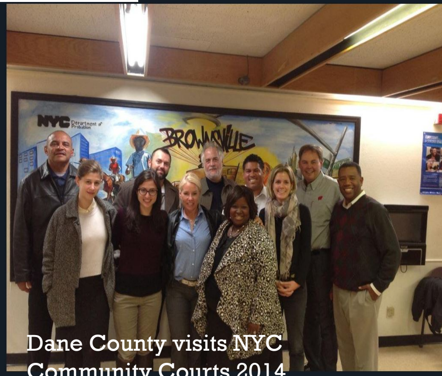
Dane County visits NYC Community Courts 2014