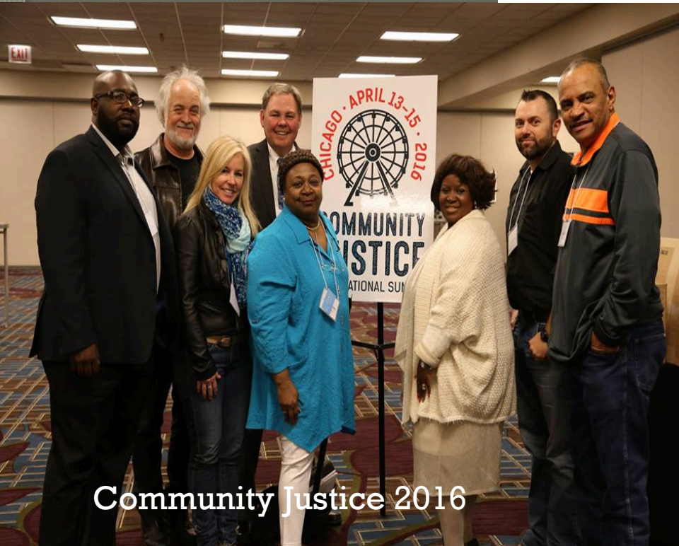
Community Justice 2016