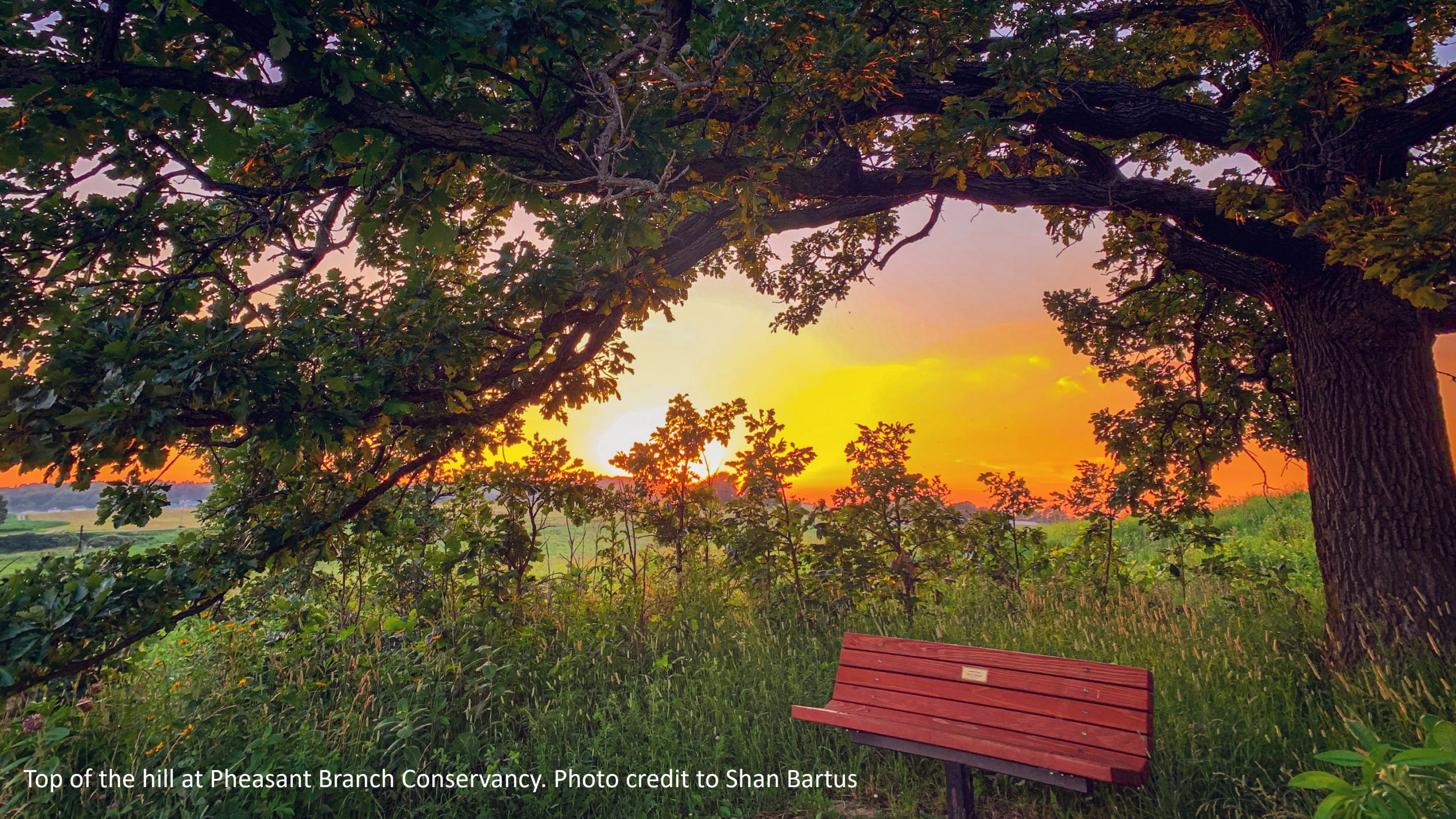
Top of the hill at Pheasant Branch Conservancy.