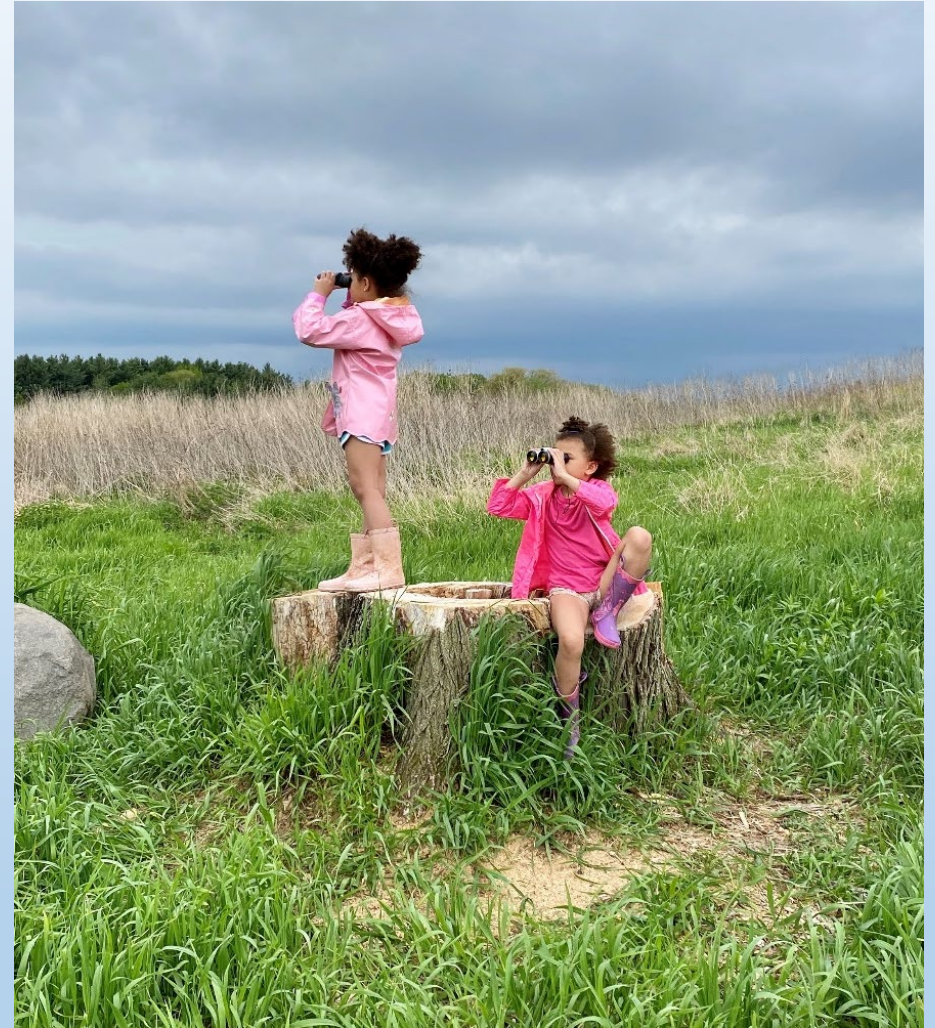
Birdwatching at the Lewis Nine Springs E-Way.