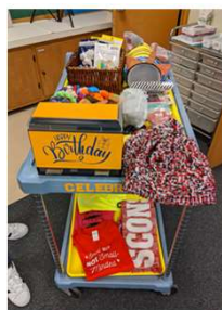
Birthday Cart at Frank Allis Elementary School in Madison