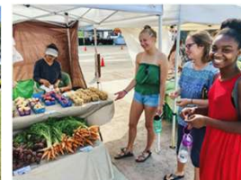
Dane County teens learn about food access through the Double Dollars Program offered at Dane County farmers' markets