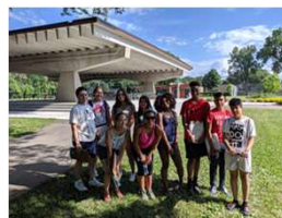
Dane County teens complete a park audit at Penn Park on Madison's south side as part of their physical activity promotion project