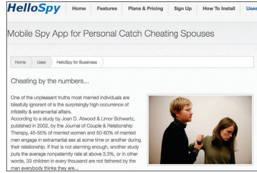
Fig. 1: Screenshot of the HelloSpy website promoting intimate partner violence [35].

store apps). While this labeling may be appropriate for other contexts, for IPV victims these tools are far too conservative. The tools do better detecting off-store spyware, but still fail to label some dangerous apps.