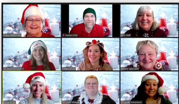
2020 AAA Holiday Zoom Staff Meeting

***Elder Benefit Specialist (EBS) Program