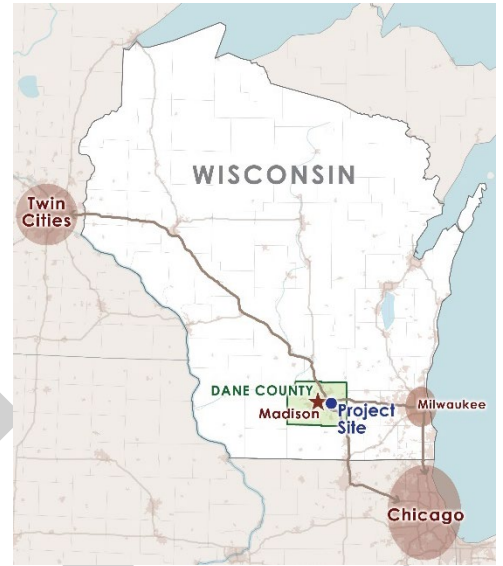
Sustainability Campus and Conceptual Locations of Facilities

The Dane County, Wisconsin, Department of Waste & Renewables is soliciting responses to this Request for Information (RFI) to gather information and qualifications from entities (Respondents) that are interested in establishing innovative waste processing, conversion, or related waste diversion technologies within the Sustainable Business Park to be co-located with the future Dane County landfill in Madison, Wisconsin. This project is underway with the first phase of construction commencing in 2026 for a new landfill and a new administration and education building (conceptual administration and education building location below). The landfill and related support facilities will be operational in 2027/2028. Through this RFI, the County is seeking core tenants to form the foundation of the Sustainable Business Park to maximize waste diversion and advance sustainable materials management.