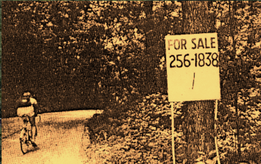
Wally Bauman Woods