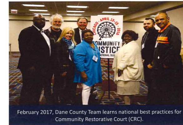
February 2017, Dane County Team learns national best practices for Community Restorative Court (CRC).