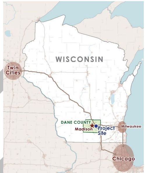
Sustainability Campus and Conceptual Locations of Facilities

The Dane County, Wisconsin, Department of Waste & Renewables is soliciting responses to this Request for Information (RFI) to gather information and qualifications from entities (Respondents) that are interested in establishing a large-scale waste diversion facility within the Sustainable Business Park to be co-located with the future Dane County landfill in Madison, Wisconsin. This project is underway with the first phase of construction commencing in 2026 for a new landfill and a new administration and education building (conceptual administration and education building location below). Landfill and related support facilities will be operational in 2027/2028. Through this RFI, the County is seeking core tenants to form the foundation of the Sustainable Business Park to maximize waste diversion and advance sustainable materials management.