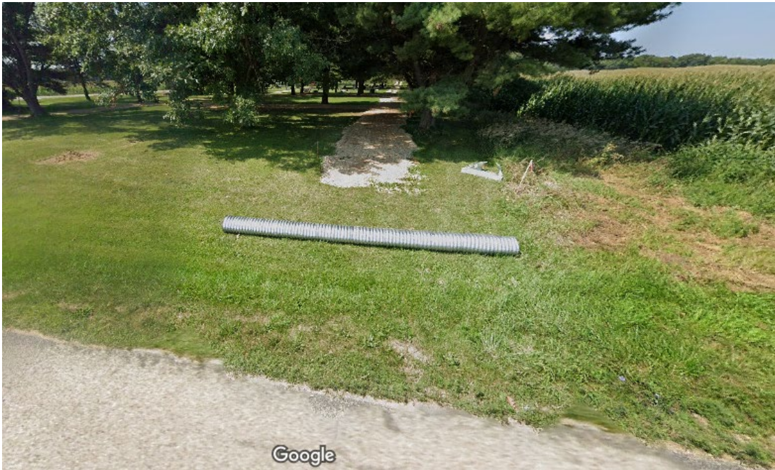
Street view August 2023 – new culvert for cemetery