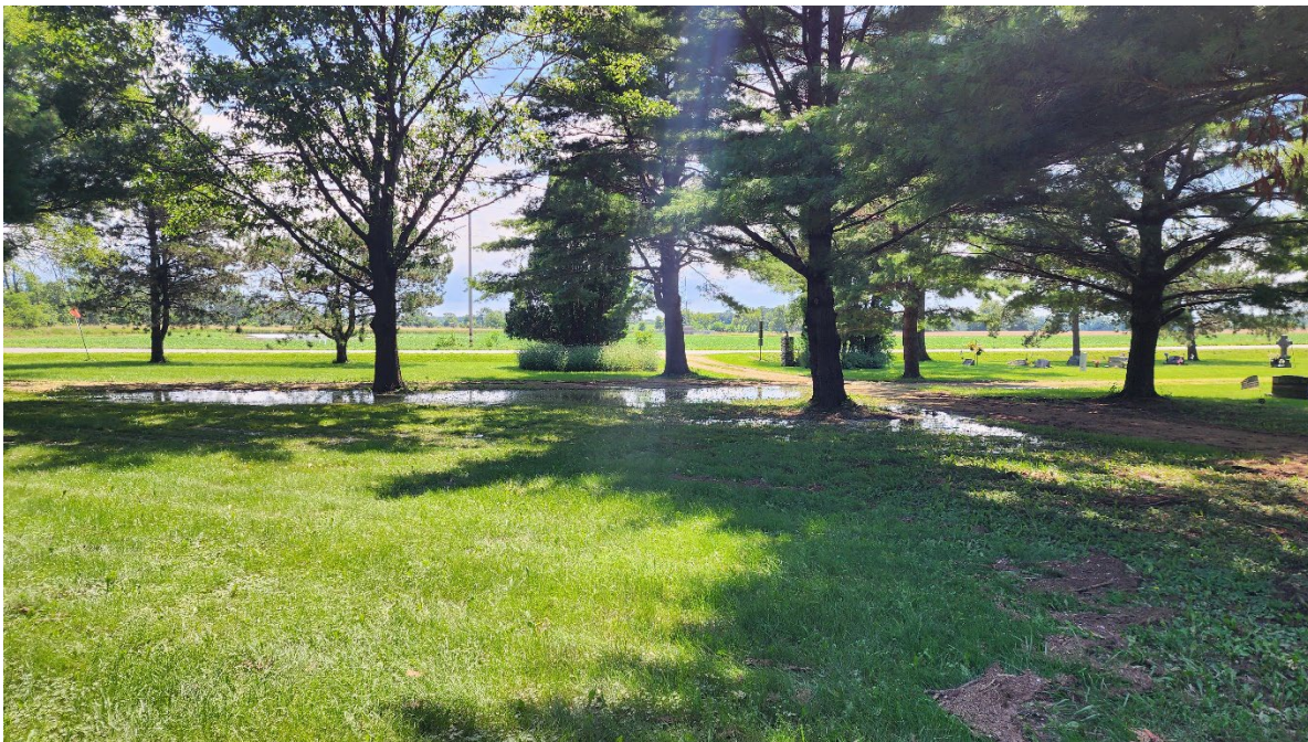
Cemetery on site