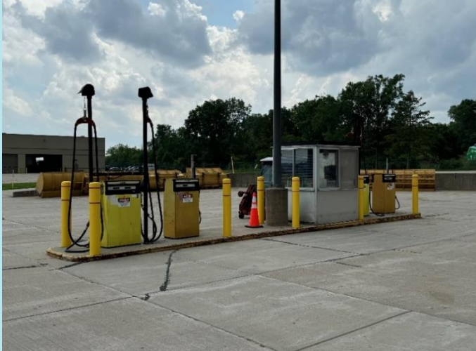
Underground Fuel Storage & Dispensers