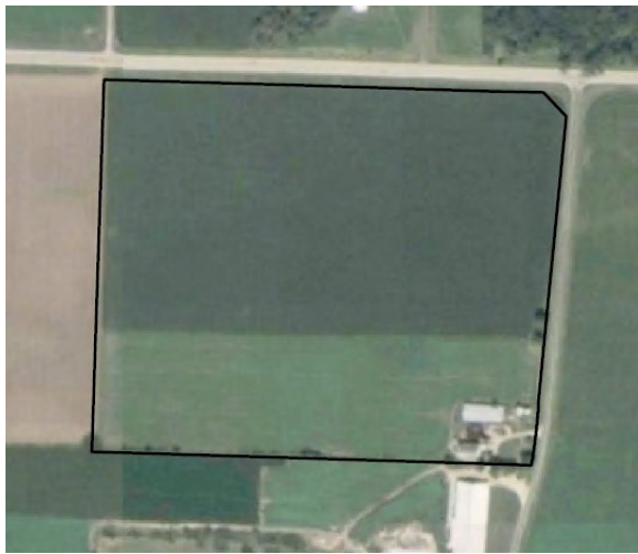
Above: Representative "low water" years show entire property in agricultural production. 1937 (left) and 2006.