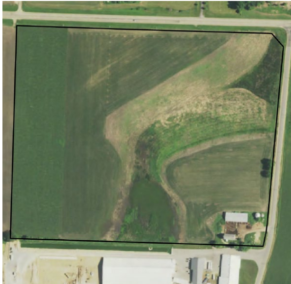
Above: Representative "high water" years show wetland signatures and surface water within the property. Top: 1968 and 1994, Bottom: 2010 and 2022.