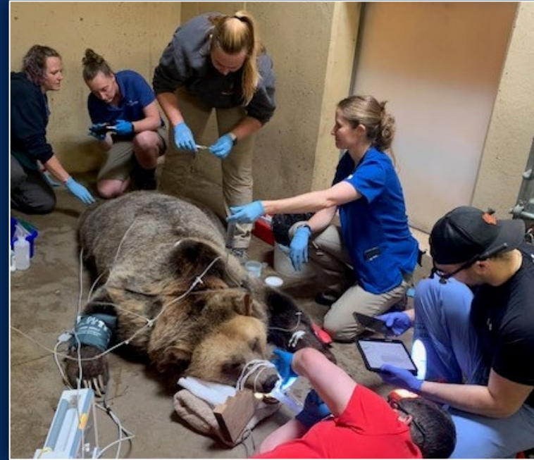
Grizzly Bear Procedure with UW Vet School