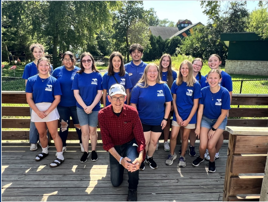
Governor Evers Visit with Teen Program