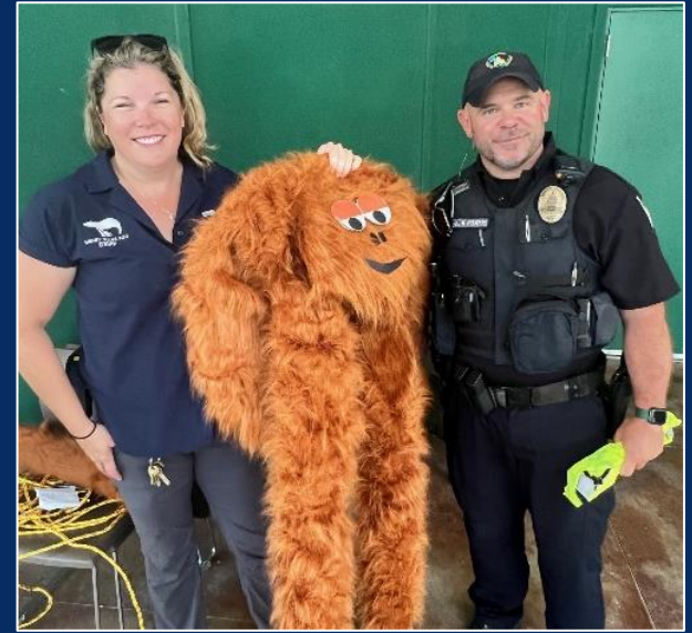
Escaped Animal Drill Coordinated with MPD 8/28/24