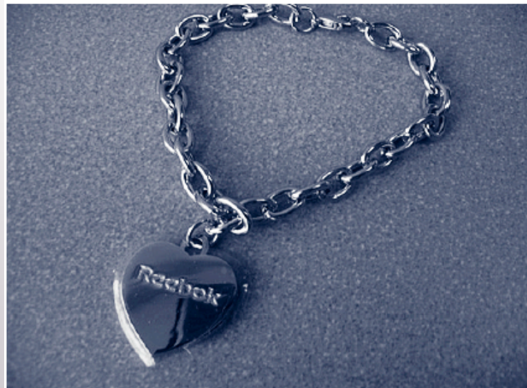
FIGURE. Heart-shaped charm bracelet that is the subject of the voluntary recall announced March 23, 2006, by Reebok International Ltd. and the Consumer Product Safety Commission