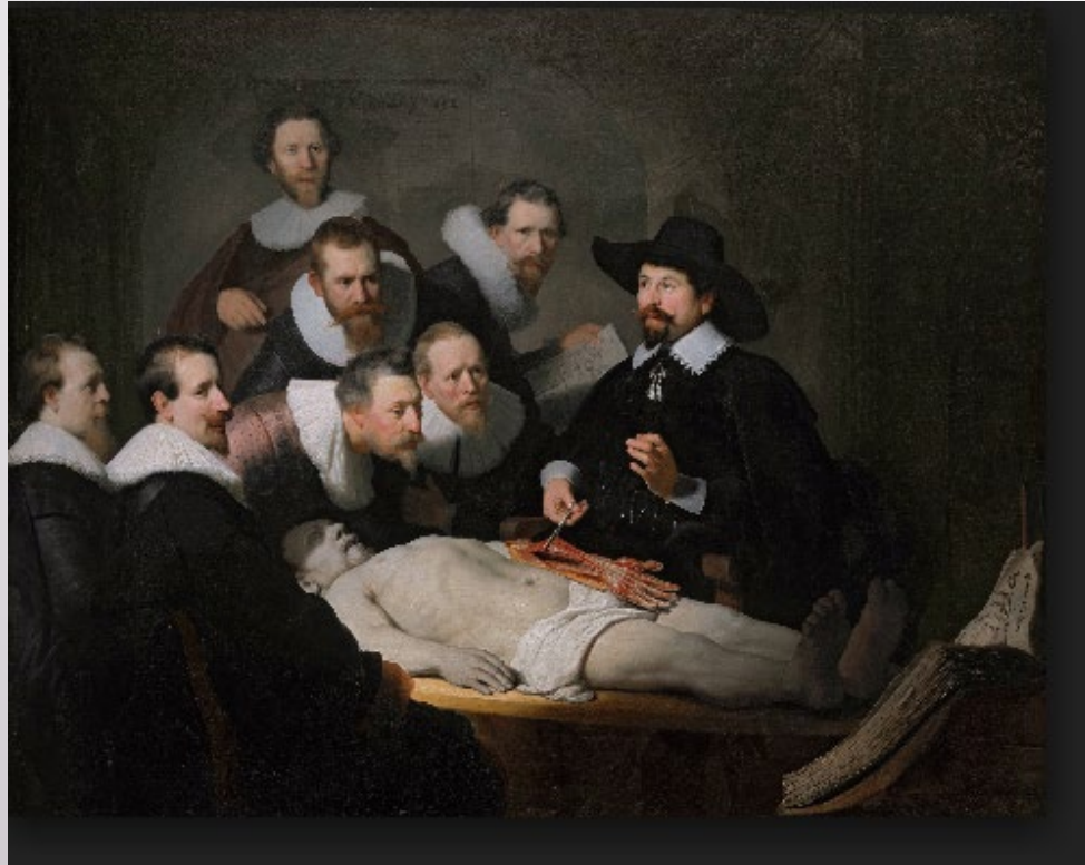
The Autopsy Lesson of Dr. Nicolaes Tulp -Rembrandt 1632