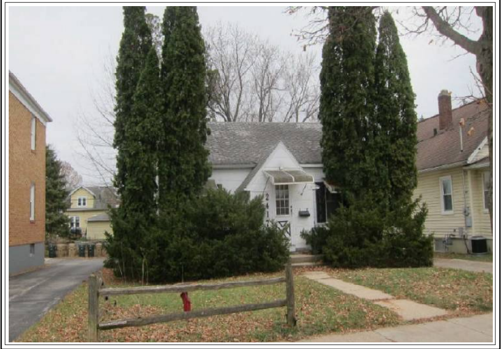
FRONT VIEW OF SUBJECT PROPERTY

Appraised Date: December 15, 2022 Appraised Value: $ 105,000