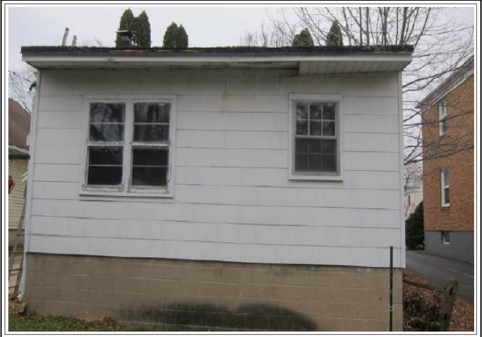
REAR VIEW OF SUBJECT PROPERTY

Appraised Date: December 15, 2022 Appraised Value: $ 105,000