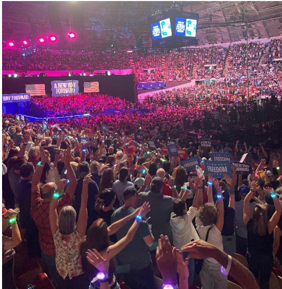
Harris/Walz Campaign Event