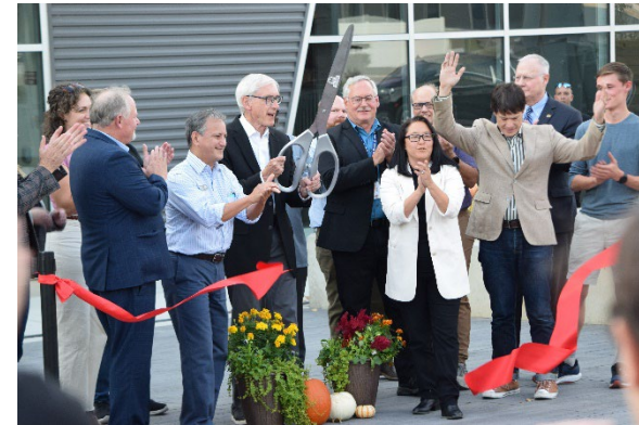
Ribbon Cutting ceremony for Plaza. Governor Evers, County Executive Kuhn, Mayor Rhodes-Conway, State Senator Agard, and several County Commissioners attended.