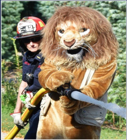
Zoo mascot helping promote MFD Zoo Takeover Event