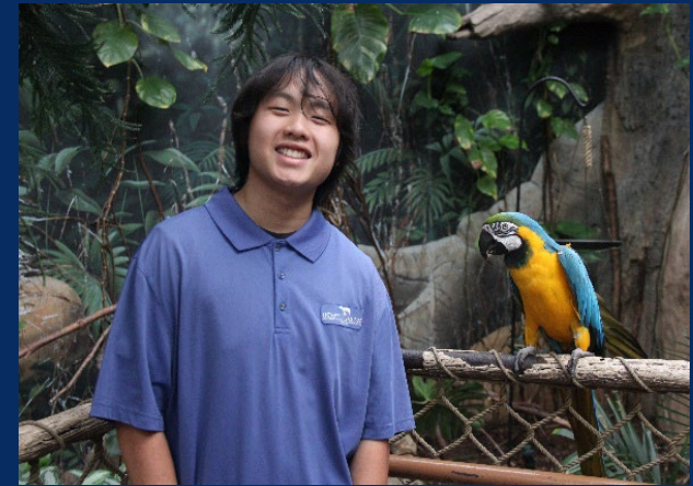
Boys and Girls Club Intern