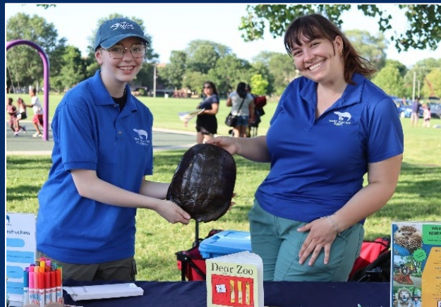
Henry Vilas Zoo Outreach Table