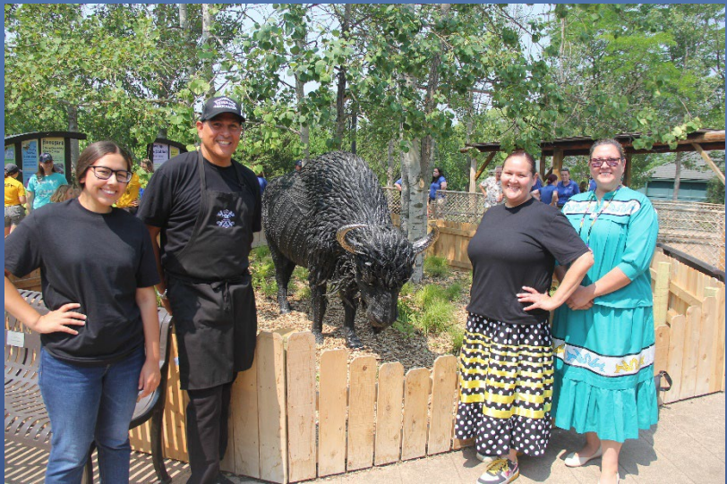
Collaborative Exhibit with Ho-Chunk