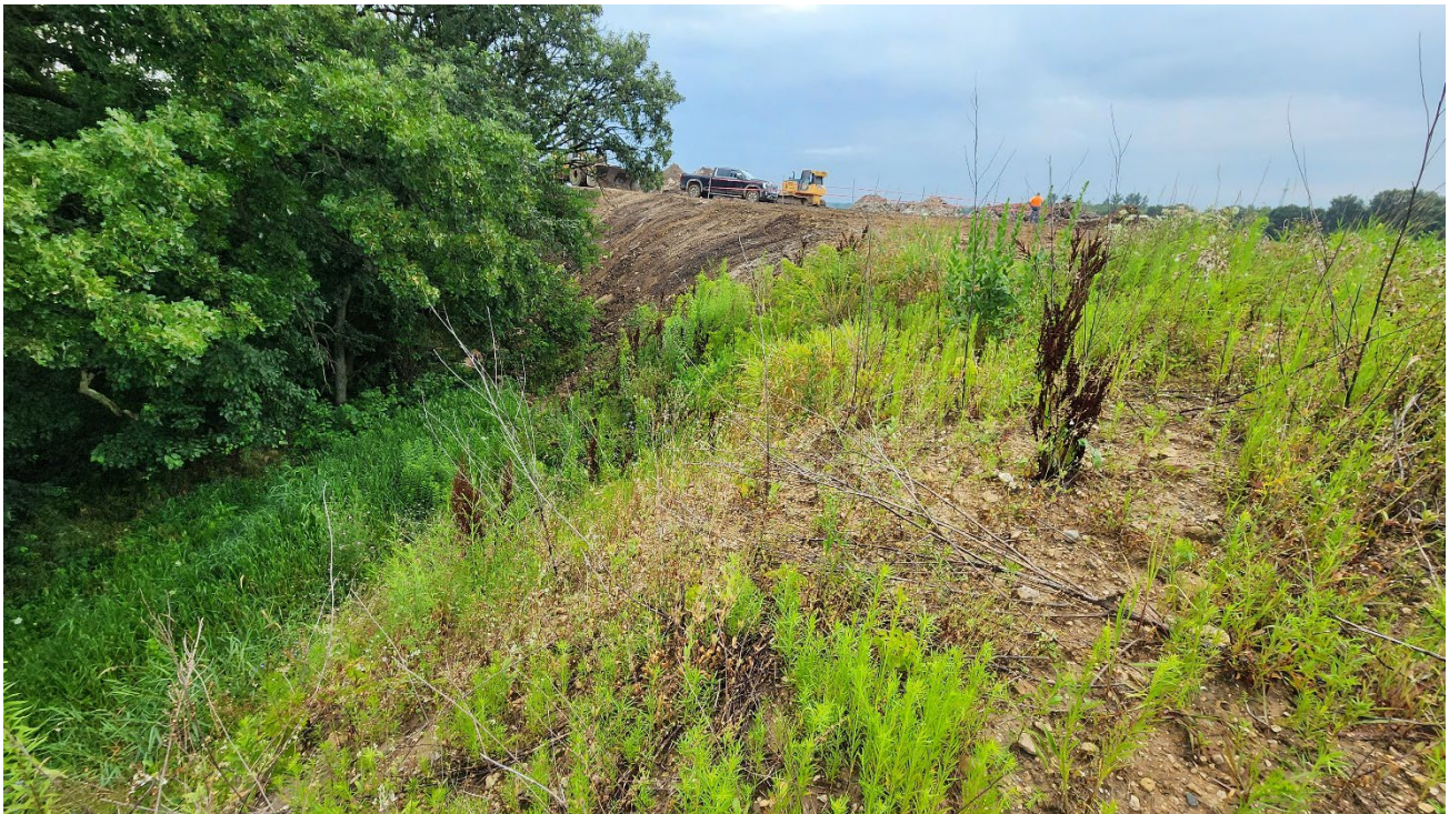
Slopes not stabilized and greater than 3:1