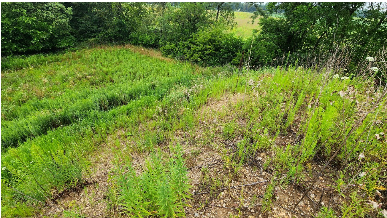
Looking northwest, slope not stabilized