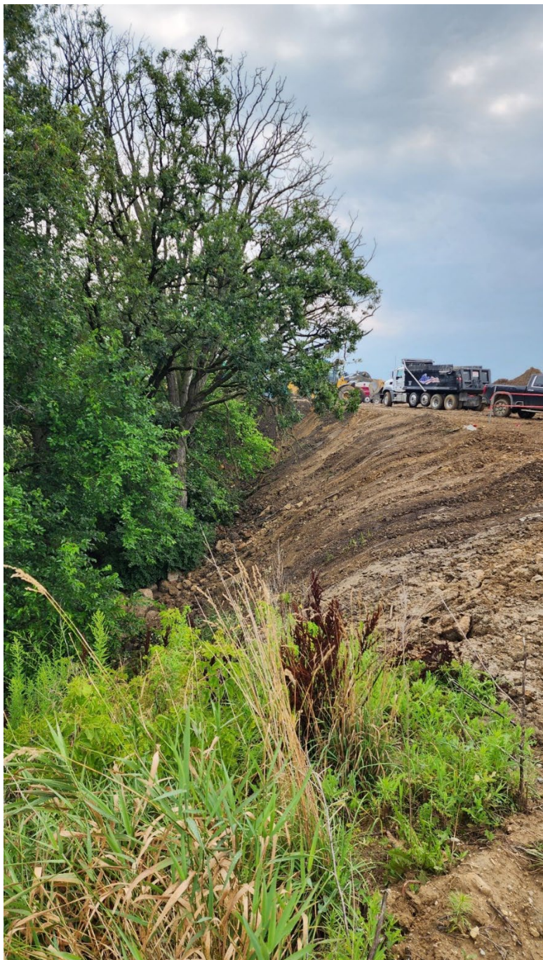
Looking east near the northwesterly corner

Lastly, the area where the material was being dumped has slopes greater than 3:1 near the northwest corner of the property. Slopes greater than 3:1 are not allowed due to erosion issues as well as stormwater concerns near adjacent properties. Also, this area is not stabilized, meaning it is not seeded or vegetated.