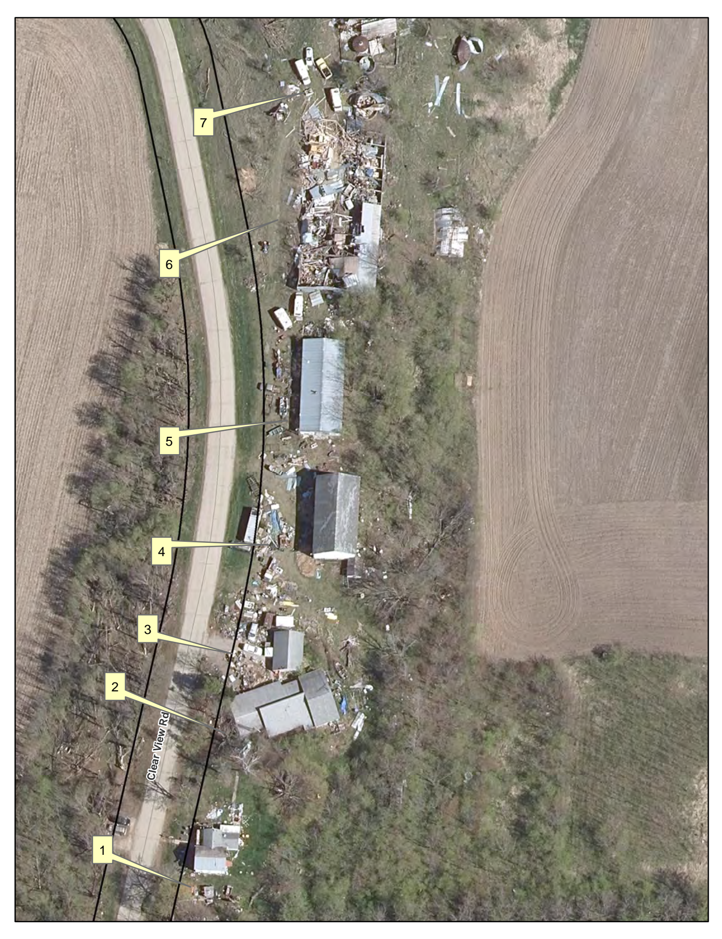
2490 Clear View Road